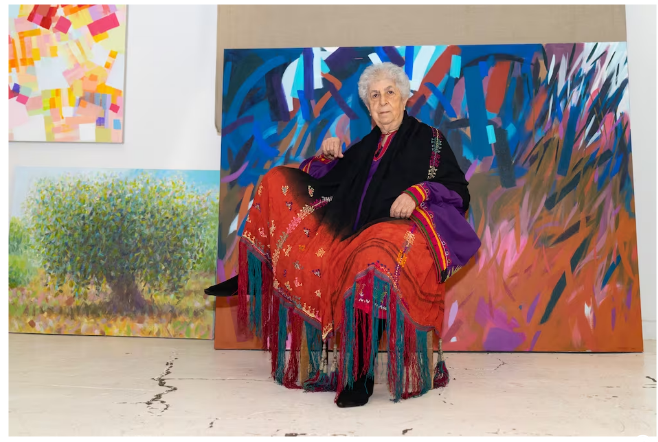
Samia Halaby pictured in 2020 in front of her artwork.

► In an exclusive interview with The National, abstract painter says she detects 'sentiment shift' among younger Americans following occupied country's struggle