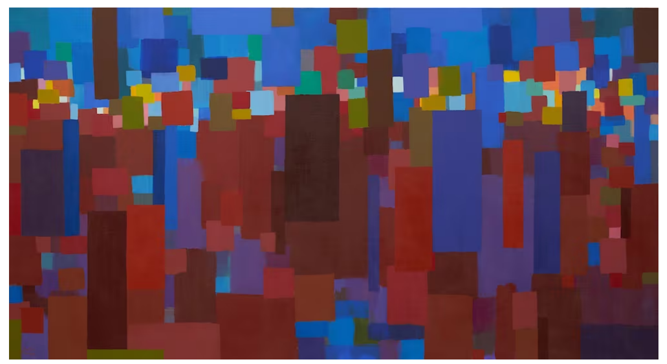
Our Beautiful Land Stolen in the Night of History, from 2016, pictures Palestine as a landscape.

Another work inspired by Palestine that was to be in the show, Our Beautiful Land Stolen in the Night of History (2016), alludes to the tawny brown earth of the country, and reflects in its aesthetic her experimentations in the digital realm.