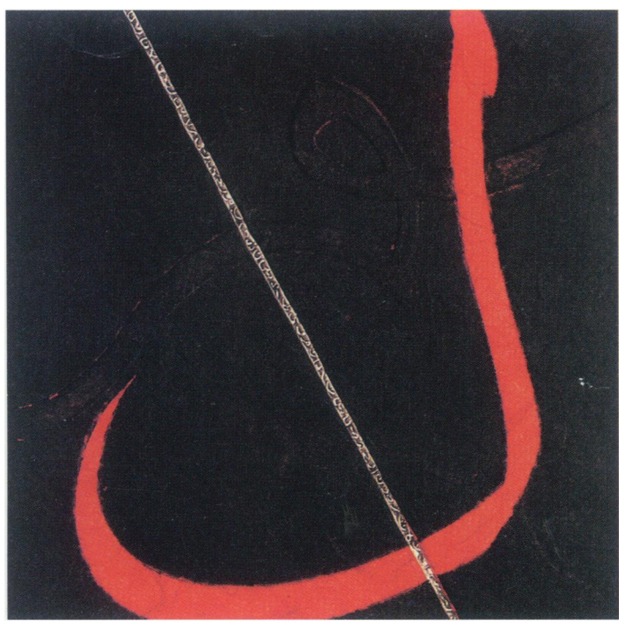
Pl. 23. Rima Farah, Red and White Letter (1997), carborundum etching, 21\frac{1}{2} " × 21\frac{1}{2} ".