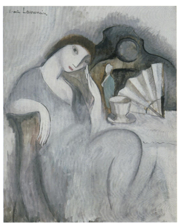
Pl. 21. Marie Laurencin, La Songeuse (c. 1911), oil on canvas, 35½" x 28½". Musée Picasso, Paris.