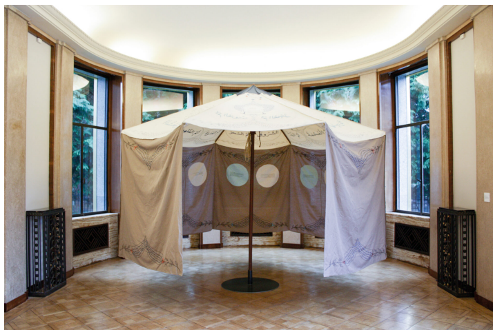
Mounira Al Solh