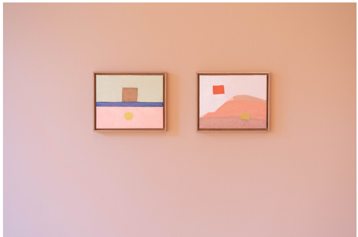
Etel Adnan