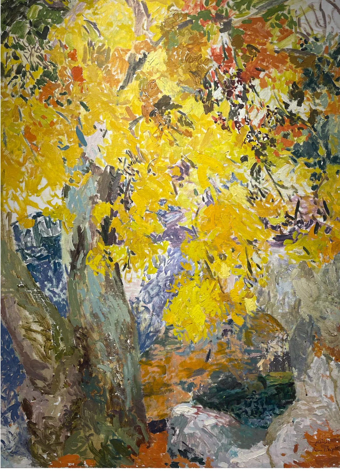
Fatima El Hajj's Yellow.

It is worth noting that most of the artists being exhibited at Art Dubai Modern are men. In fact, the only female artist exhibited in the section is El