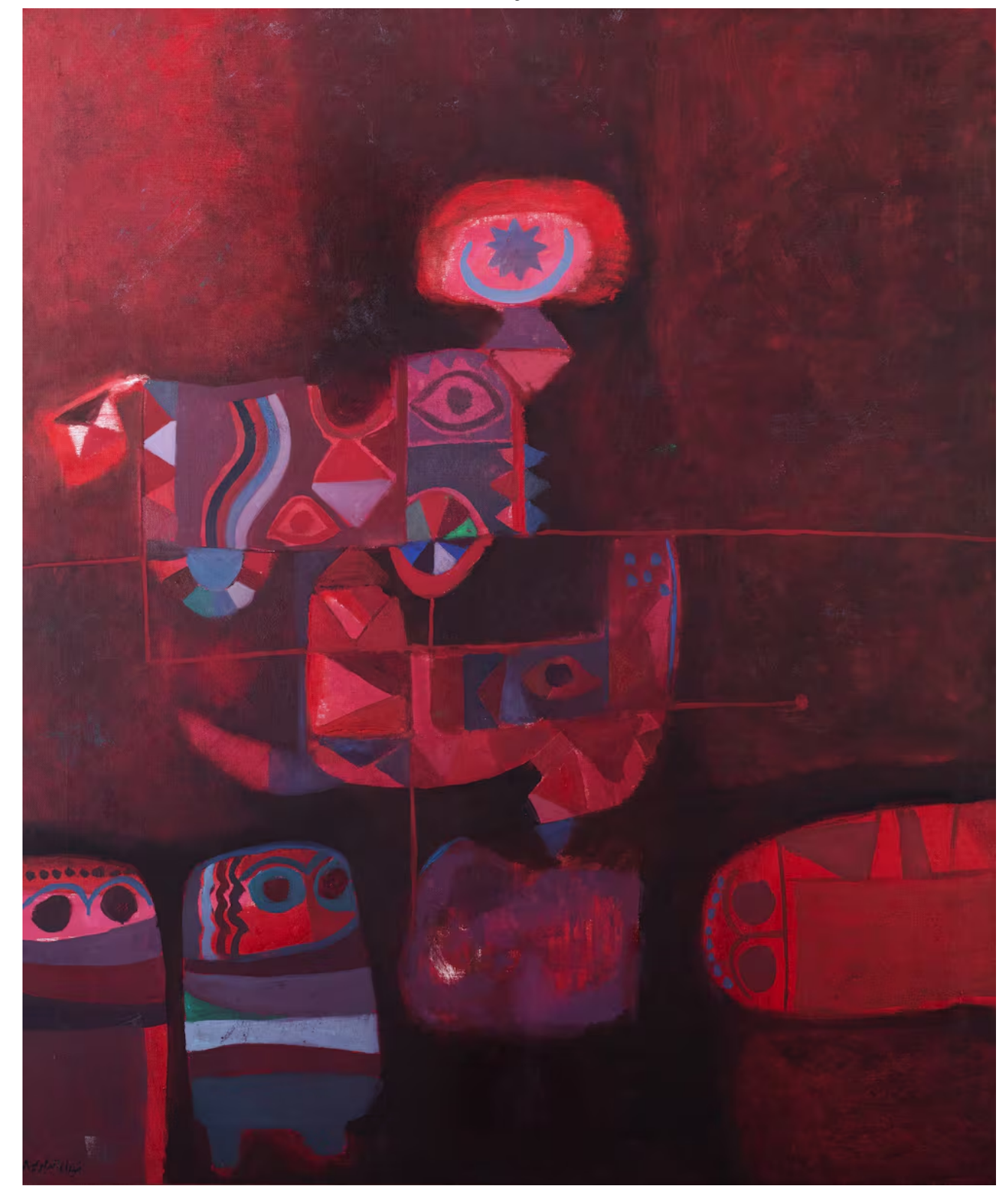
Dia Al Azzawi's Figures in Red.