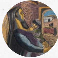
MOTHERHOOD Inji Efflatoun EGYPT