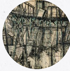
THE HIGH DAM Effat Naghi EGYPT