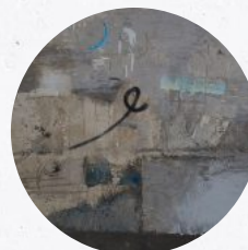
THE VICTORIOUS Shakir Hassan Al Said IRAQ