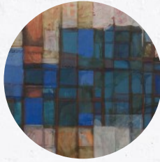
RED LINES Asaad Arabi SYRIA