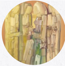
UNTITLED Paul Guiragossian ARMENIA, LEBANON, PALESTINE