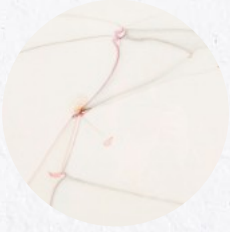
EROTIC COMPOSITION Huguette Caland LEBANON