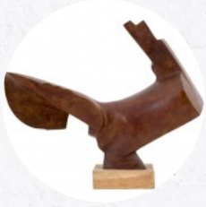
THE ROOSTER Adam Henein EGYPT