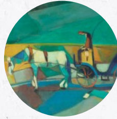
NOCTURNE Seif Wanly EGYPT