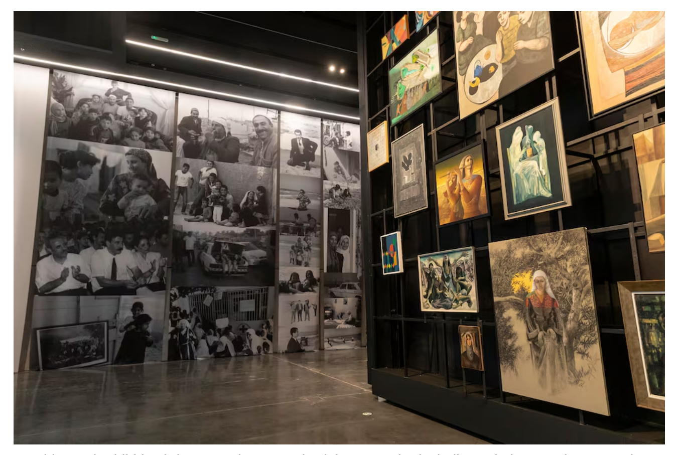
On This Land exhibition brings together 100 Palestinian artworks, including paintings, sculptures and digital works.