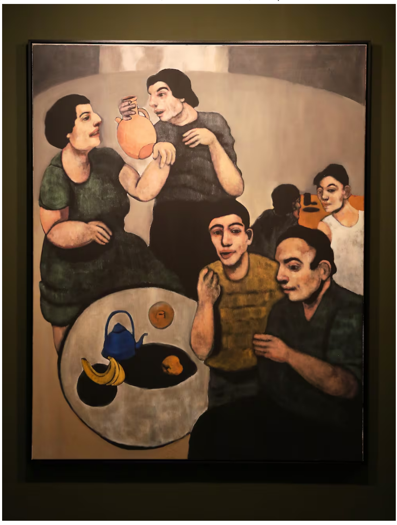
The City Before it was Transformed (2021) by Raafat Ballan.

These include an untitled 1946 painting by Jabra Ibrahim Jabra, which depicts three sombre figures painted with oil on jute fibre. Works from the Sabra Shatila etching series by Azzawi, meanwhile, are also on display. The etchings, produced in 1983, were a response to the 1982 massacres of Palestinian refugees and civilians in Beirut during the Lebanese Civil War.