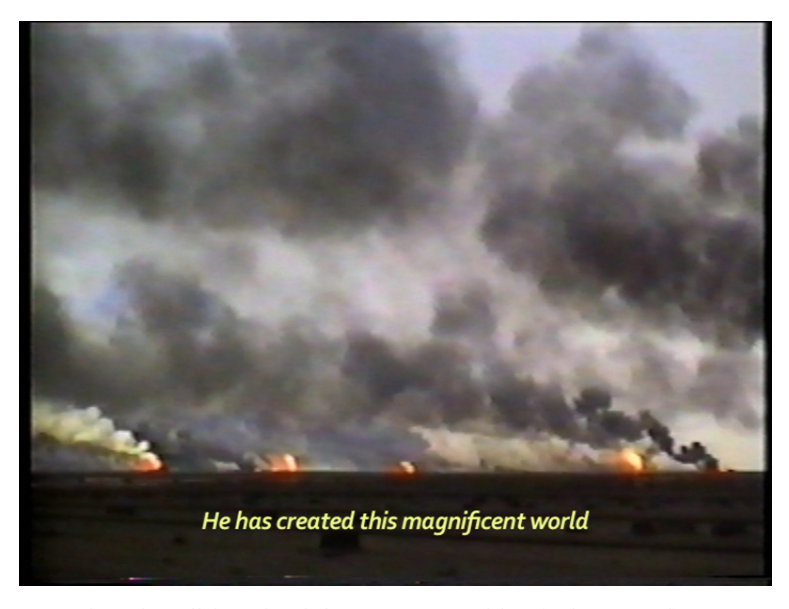
Monira Al Qadiri, Behind the Sun , 2013. Video (color, sound). 10:00 minutes.

The term 'theater of operations' refers to the totality of land, air, and sea contained by a discreet military operation within a larger 'theater of war' waged between opposing forces<sup>1</sup>. There is an implied hermeticism to these words, a total spatial and martial enclosure that reaffirms the Western forays into the Gulf Wars as a series of "surgical" strikes specifically targeting only "legitimate" combatants,