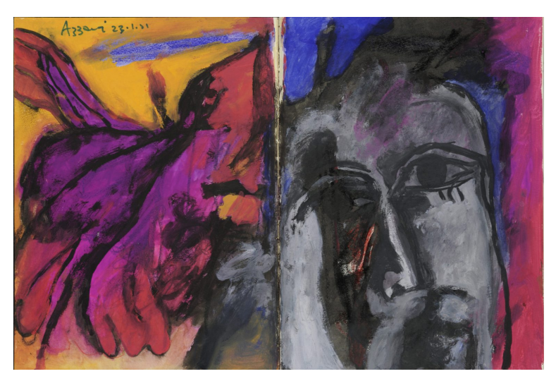
Dia al-Azzawi, War Diary No. 1 , 1991. Gouache and charcoal on paper, 28 pages, 12 x 9.5 inches.

Victim's Portrait (1991), renders a large and colorfully abstracted face of an Iraqi soldier immolated by the allied aerial bombing during the Iraqi retreat from Kuwait. The work is hung next to an archival copy of the British Observer, which published a controversial frontpage image of the burned corpse after American outlets refused to circulate it.