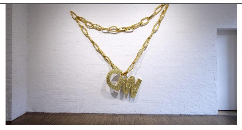
Installation view of Thomas Hirschhorn, Necklace CNN (2002) on view in the exhibition Theater of Operations: The Gulf Wars 1991–201, MoMA PS1, New York, November 3, 2019–March 1, 2020.

But for every distant Western view on the conflict within the show, there is an on-the-ground riposte. Monira Al Qadiri's large-scale video projection, Behind the Sun (2013), chronicles the wanton burning of oil fields in Kuwait by Iraqi forces withdrawing from the advancing American-led coalition in 1991. Filmed by a local Kuwaiti, overlaid with spoken Arabic poetry from daytime television programs, unseen poets praise the heavenly beauty of nature in stark contrast to the hellscape blazing before their eyes. These dueling fields of vision—one aerial, the other landscape—broadly evoke the disparity between the American view of the wars and its lived experience in the Gulf.