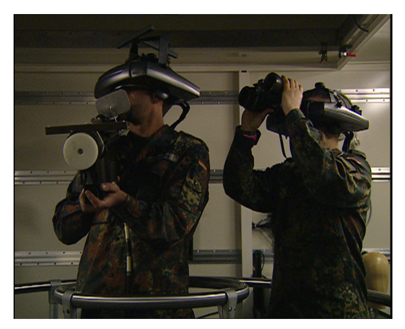
Harun Farocki, War at a Distance , 2003. Video (color, sound). 58:00 minutes. Museum of Modern Art. Committee on Film Funds. © 2019 Harun Farocki Filmproduktion.

modern Iraq with its ancient cultural heritage. Gulf War has little depth—the folds of the woman's dress flowing directly into the striated wings of the guardian behind her, both figures pierced by bullet holes. In War Painting , the dress becomes a fluted column, while both the woman and the stone face behind her weep at the ruins strewn about. Decades before the Islamic State made it a media spectacle to destroy history, Iraqi artists understood the intertwined nature of the human and cultural toll of war.