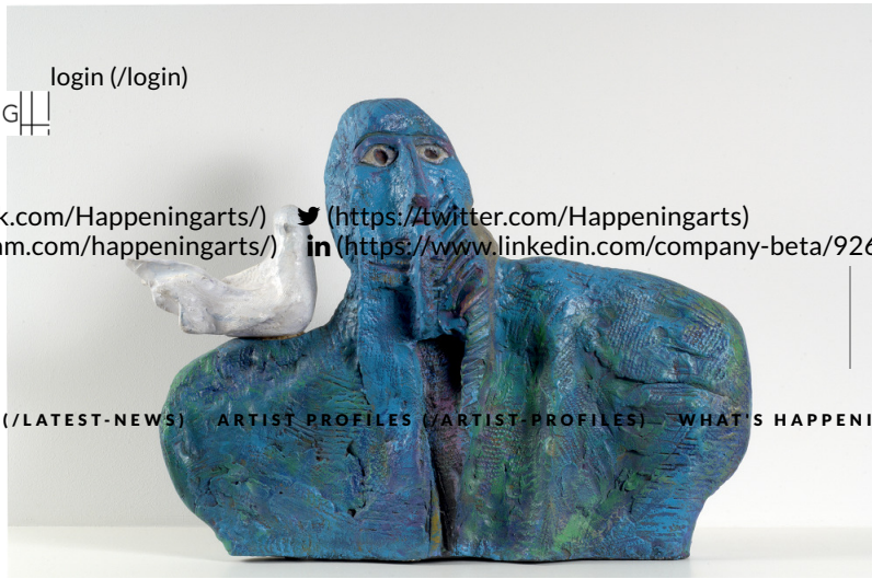
Dia Al-Azzawi, Peace Lover, 1986. Acrylic on terracotta. Pièce Unique. Donation Claude & France Lemand. Museum, Institut du monde arabe, Paris.

MAGAZINE (/LATEST-NEWS) | ARTIST PROFILES (/ARTIST-PROFILES) | WHAT'S HAPPENING ? (/WHATS-HAPPENING)