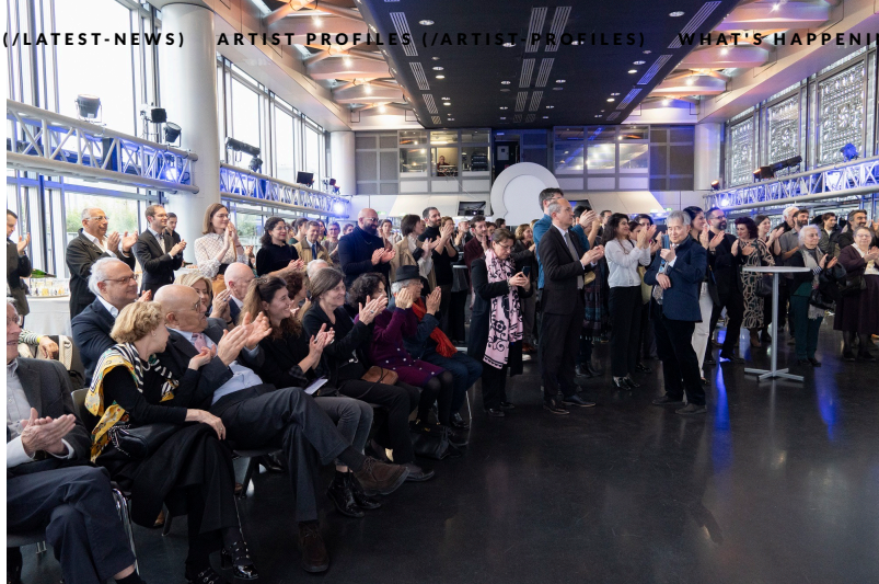
Legion of Honor ceremony, April 5, 2024 at the IMA.

MAGAZINE (/LATEST-NEWS) ARTIST PROFILES (/ARTIST-PROFILES) WHAT'S HAPPENING ? (/WHATS-HAPPENING)