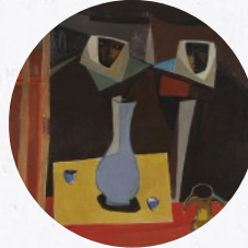
BEDOUIN TENT Faik Hassan IRAQ