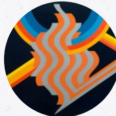
UNTITLED Mohammed Melehi MOROCCO