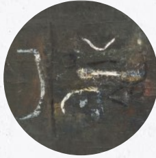
UNTITLED (BLACK) Shakir Hassan Al Said IRAQ