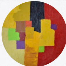
AUTUMN IN YOSEMIT... Etel Adnan LEBANON