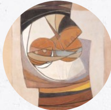
COMPOSITION (PALE... Mohammed Kacimi MOROCCO