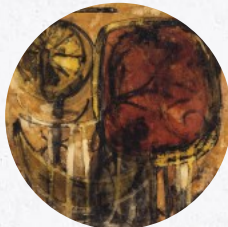
UNTITLED (RED) Ahmad Shibrain SUDAN