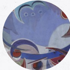
UNTITLED Madiha Umar IRAQ