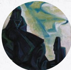
THE LAND OF SOLID... Mounirah Mosly SAUDI ARABIA