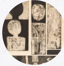
UNTITLED Munira Al Kazi KUWAIT