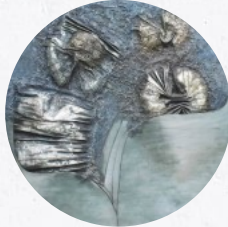
COMPOSITION Saleh Al Jumaie IRAQ