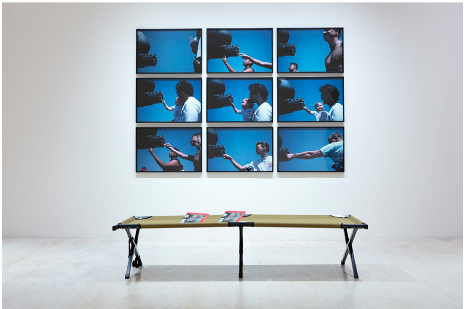
Allan Sekula, War Without Bodies, 1991/1996, installation view, 'Theater of Operations: The Gulf Wars 1991–2011', MoMA PS1, New York