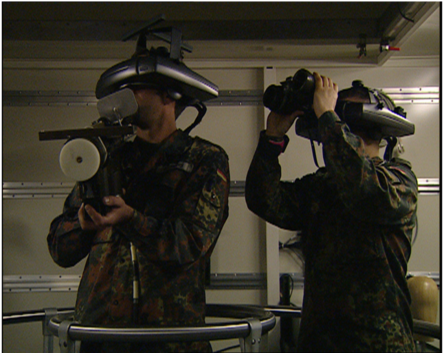
Harun Farocki, War at a Distance , 2003, video still. Courtesy: the artist and The Museum of Modern Art. Committee on Film Funds. © 2019 Harun Farocki Filmproduktion

Curated by Peter Eleey and Ruba Katrib, 'Theater of Operations' is organized into three main sections: the invasion of 1990–91; the embargo years, when Iraq was isolated and impoverished by US-led sanctions; and the 2003–04 conflict, including the human-rights violations committed by the US military against detainees at Iraq's Abu Ghraib prison, a key flashpoint for Western artists. The show takes in painting and sculpture, mostly by Arab artists, and political responses by Western artists, mainly in tech idioms.