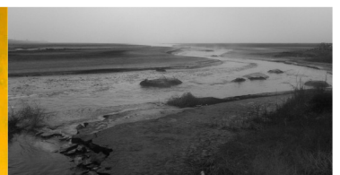
A River Flows Downstream