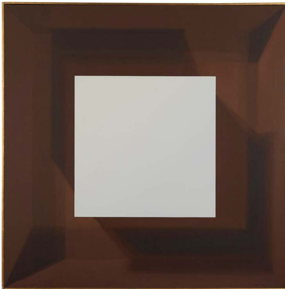
Samia Halaby, White Cube in Brown Cube , 1969. Oil on canvas, 48 × 48 inches.

slashes bend and stretch like living creatures, Boullata's letters and phrases are hard-edged and angular and contained; they are tightly controlled shapes organized to a steady beat, which twist his linguistic references to Arabic and Sufi proverbs and Quranic verses almost into illegibility.