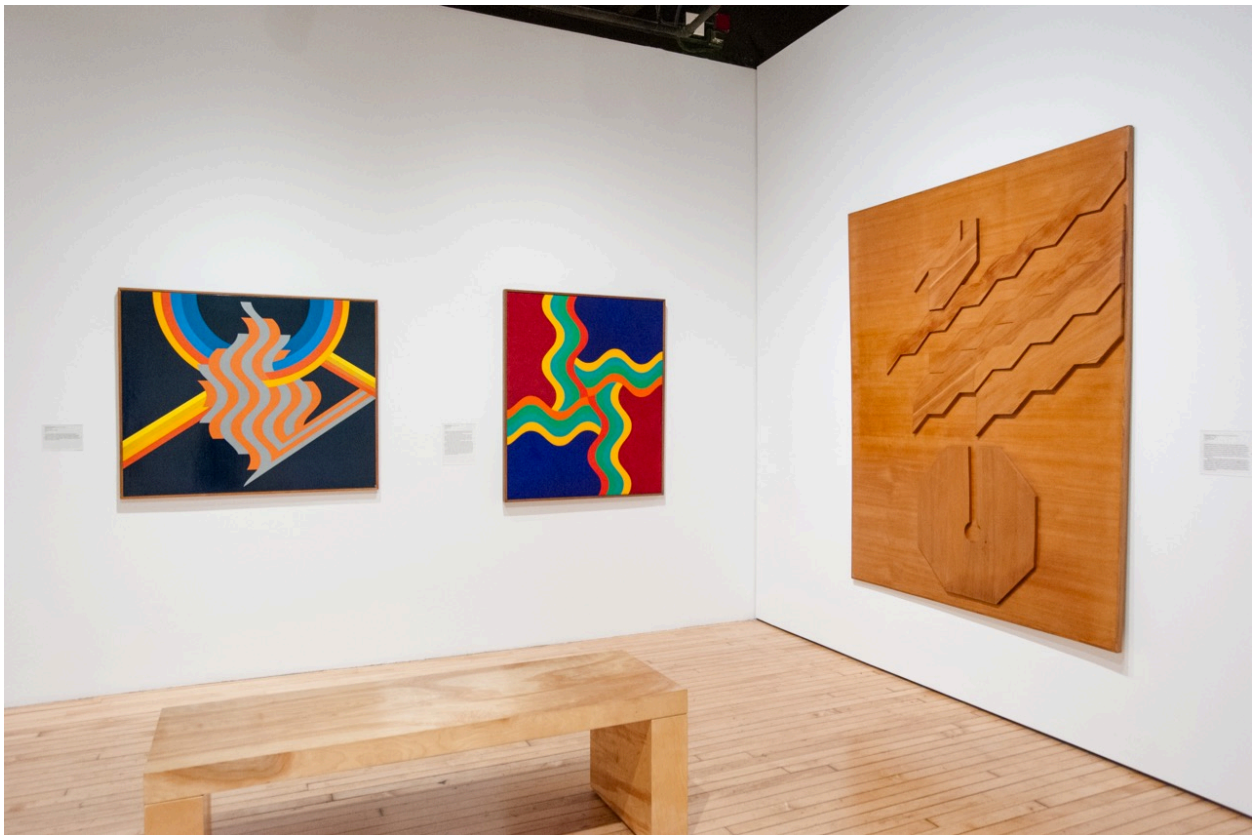
Taking Shape: Abstraction from the Arab World, 1950s-1980s , installation view.

An exhibition gathers four decades of abstract art from the Arab world.