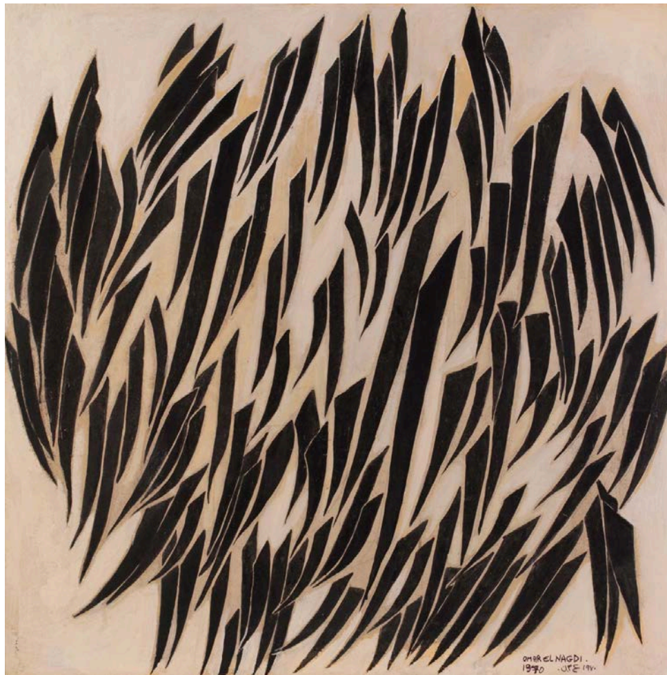
Omar El-Nagdi, Untitled , 1970. Mixed media on wood, 47 × 47 inches.

Refreshingly, as the curators map out this history and how it unfolded in different places and times, they do not silo the selected artists based on nationality; nor do they congratulate the women on the fact of their sex by segregating them like some exotic species (in her discerning catalog essay, Salwa Mikdadi, an art historian and curator who has long championed several of the artists here, points out the problems of this particularly Western predilection for the exhibition category of the “Arab woman artist”). Instead, the show appears to be arranged on the basis of formal and conceptual affinities between the artworks, allowing for a vigorous resonance of aesthetic calls and responses between the eighty-plus pieces on view (which include paintings, sculpture, and works on paper).