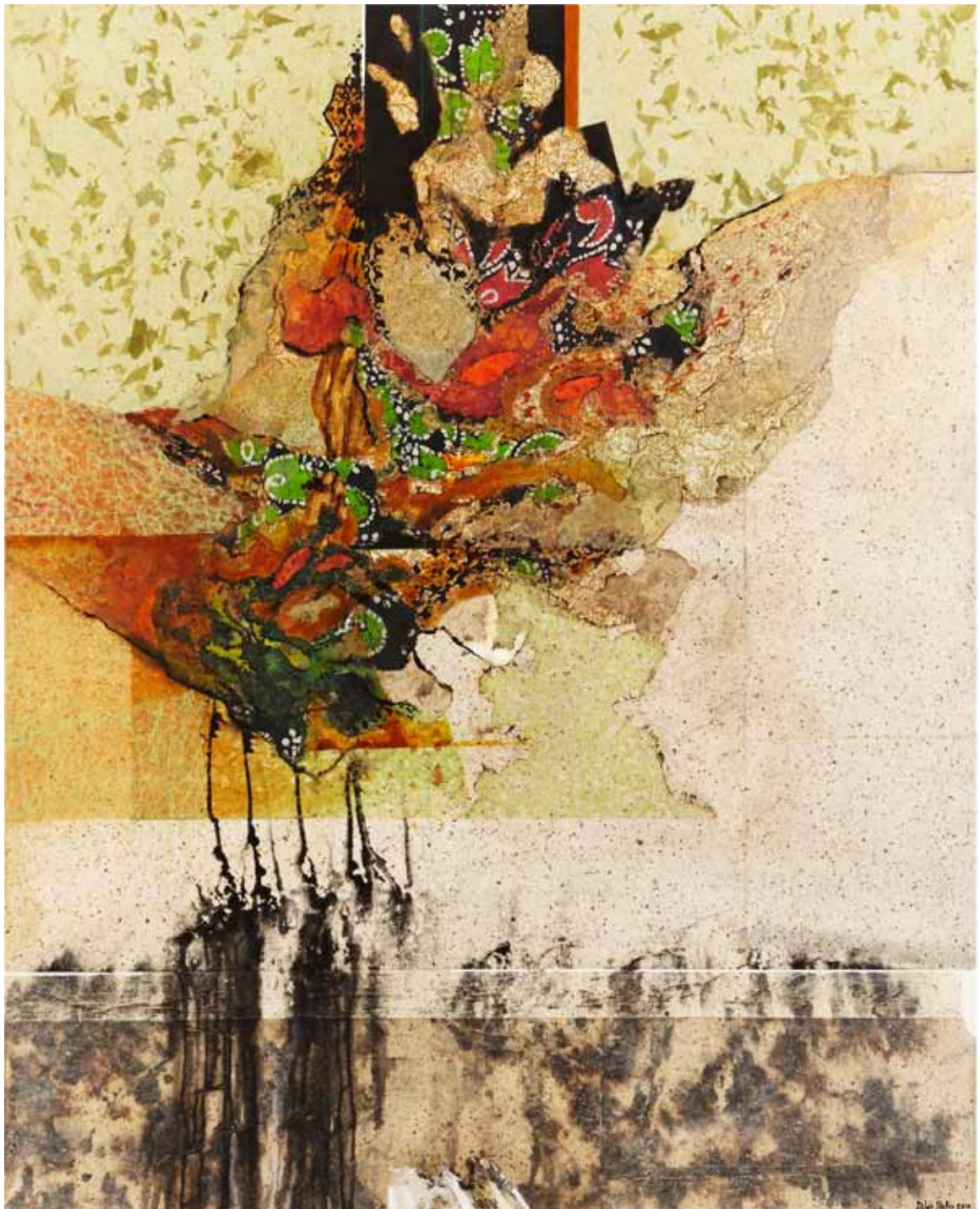
Delair Shaker, Wings of Hope (2010), mixed media on canvas, 152 x 122 cm