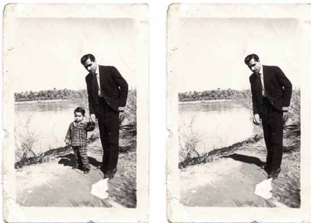
Nedim Kufi, Absence (2010) , Photographic print on canvas, 180 x 240 cm (180 x 120 cm each), Barjeel Art Foundation