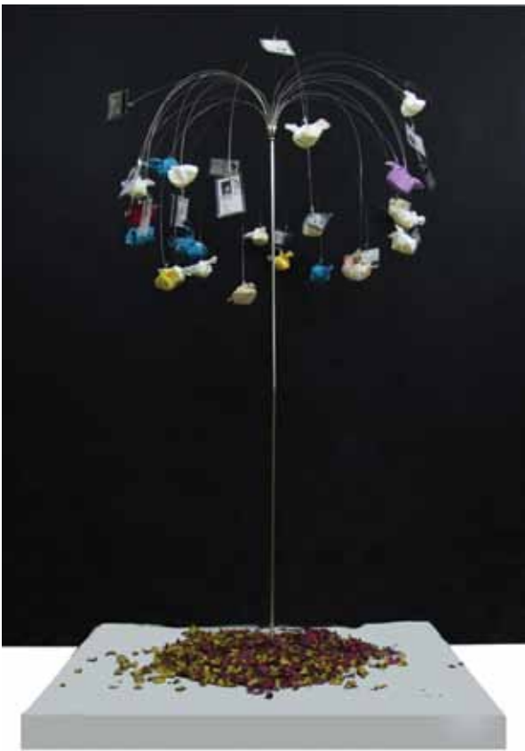
Ghassan Ghaib, The Tree of Memories (2010), Nickel with mixed media, 165 x 80 cm .

Tigris 'from a space of beautiful memories to an arena stained with sectarian conflict and policy.' Yahya, now settled in Houston, graduated from the Academy of Fine Arts with a degree in painting in 1987. Having grown up in Baghdad, he recalls: