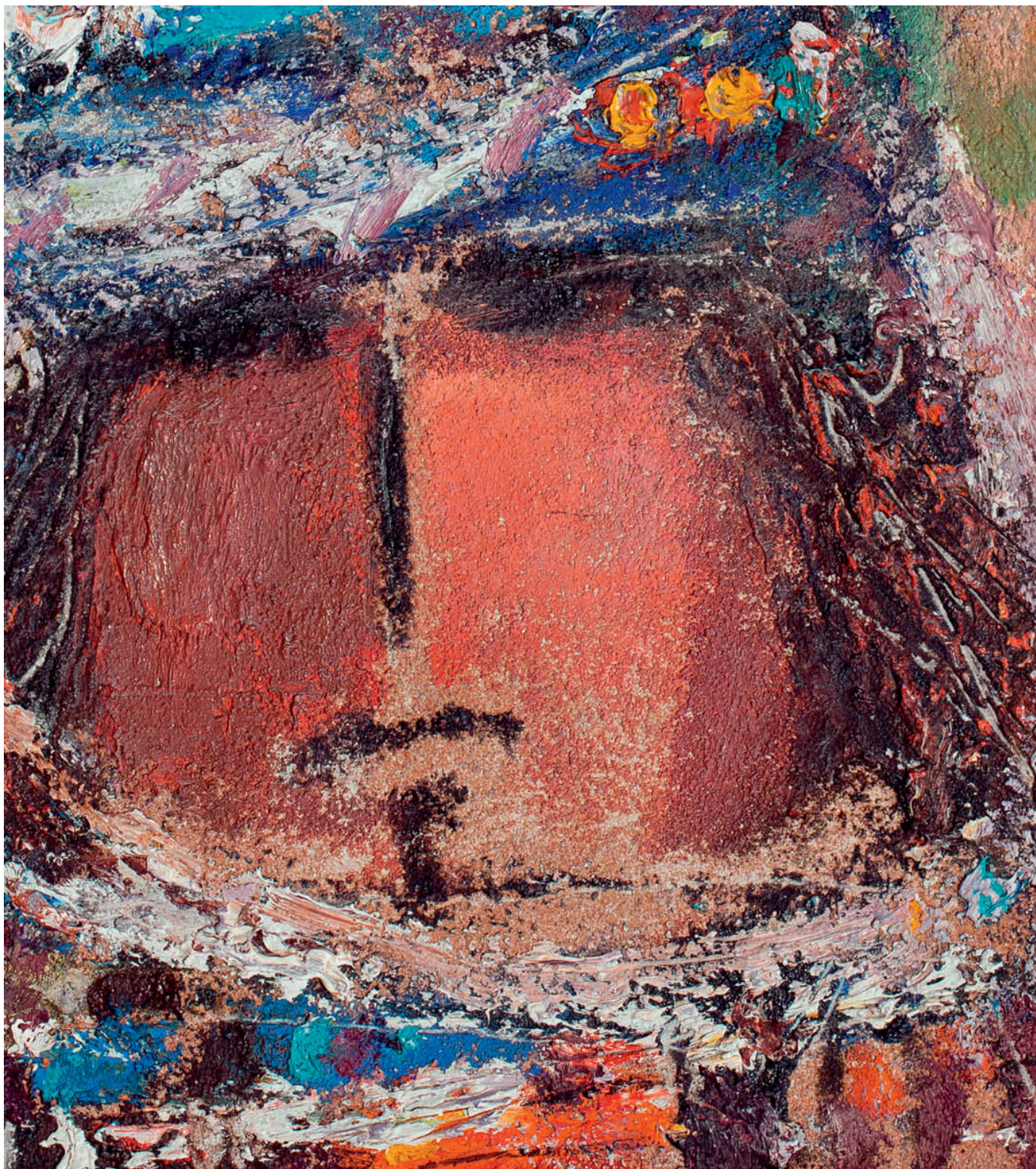
Face. Fateh Moudarres. Oil on Wood. 30 x 25cm.

The plan is for it to host exhibitions and alternative arts and culture events. Future Concrete shows are yet to be revealed, but Jurkute says a few dates are already booked for 2019.