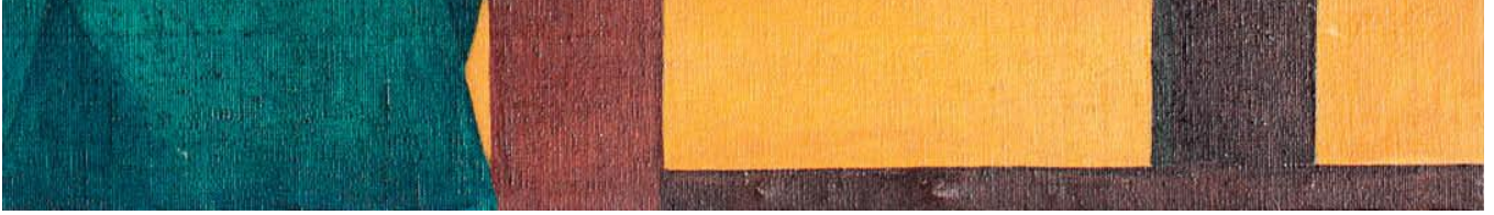
Nap. Louay Kayyali. 1975. Oil on Canvas. 95 x 75cm.

“The idea was to show the diversity and richness of the Syrian social fabric from the early 20th century until today,” says Atassi. She hopes the show will help generate greater awareness of art in Syria, “bring to light the true face of our country” and “re-emphasise the role of art and culture in building bridges and opening up dialogue.”