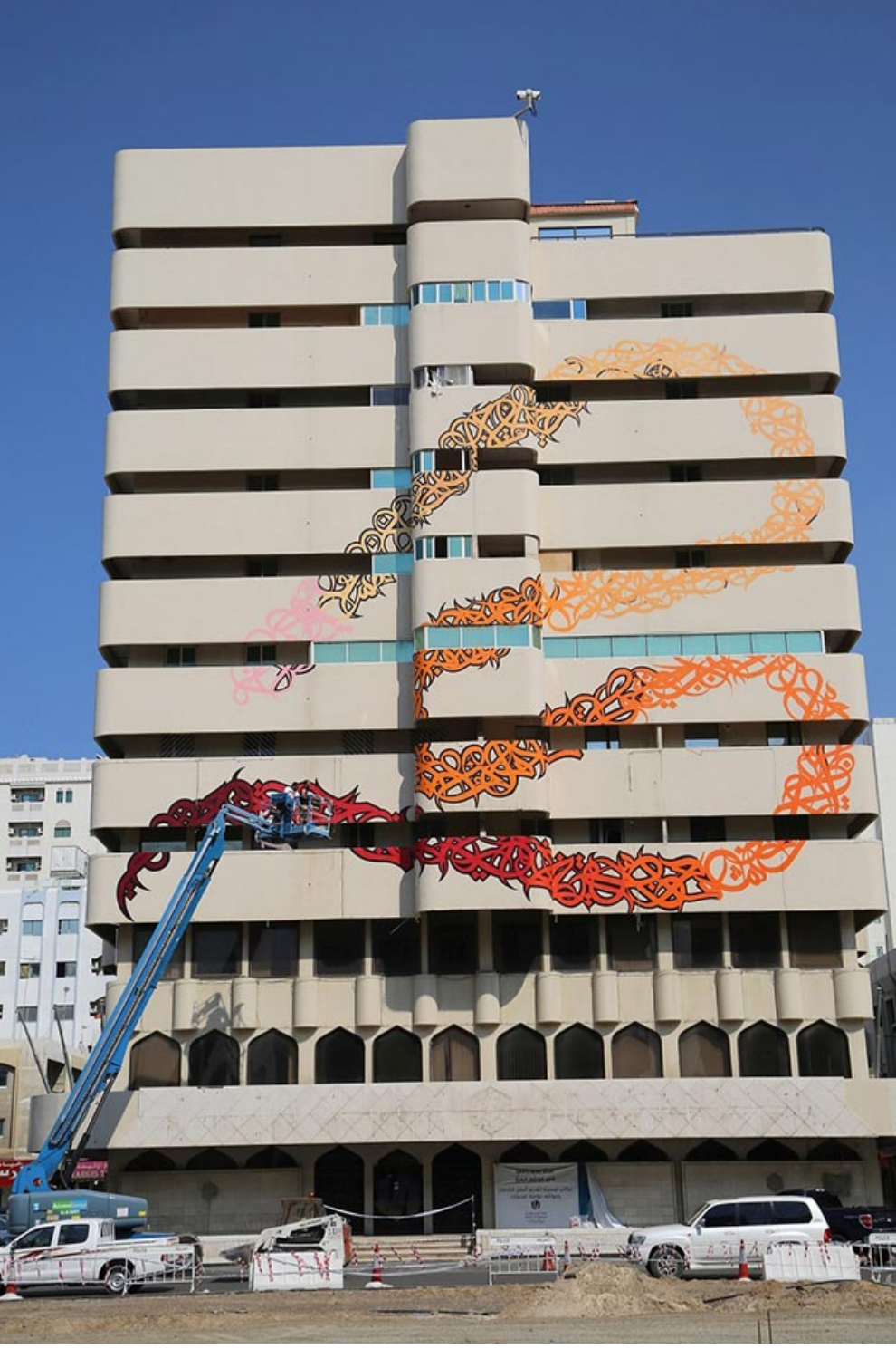
Calligraffiti Mural Art by eL Seed