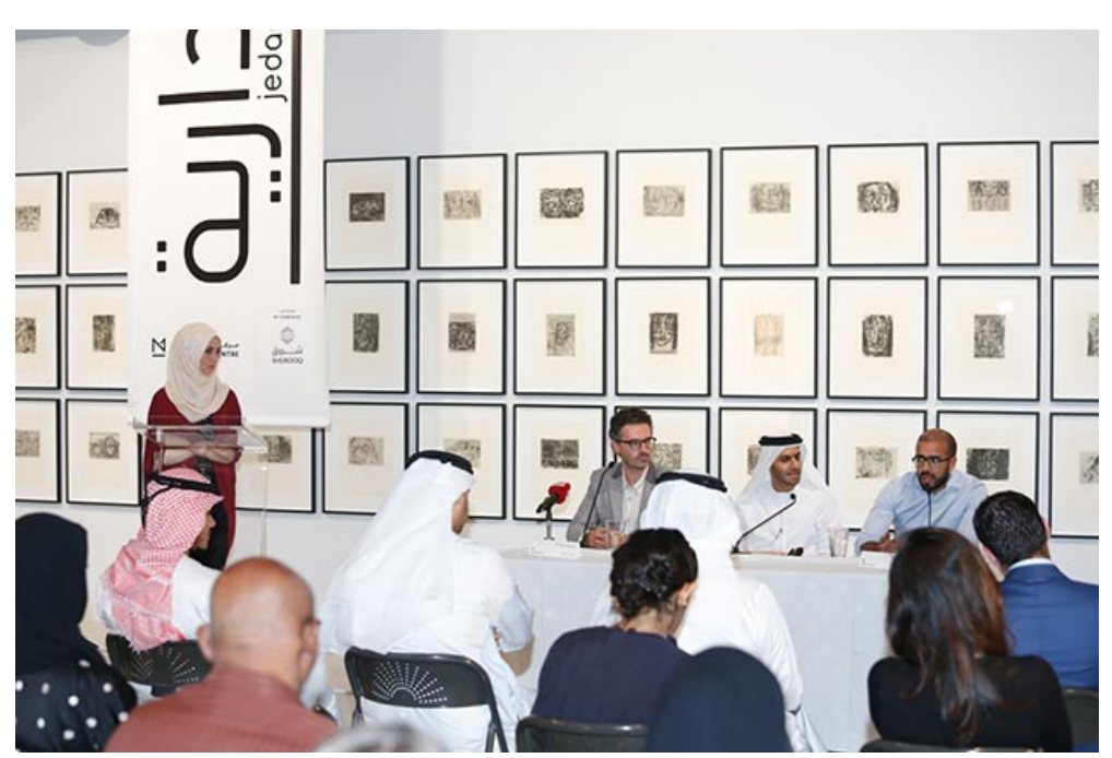
Images from the Launching Press Conference / Courtesy of Maraya Art Centre