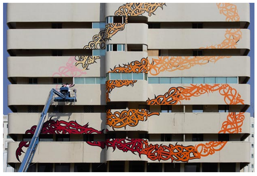
Calligraffiti Mural Art by eL Seed, detail / Courtesy of the Artist and Maraya Art Centre