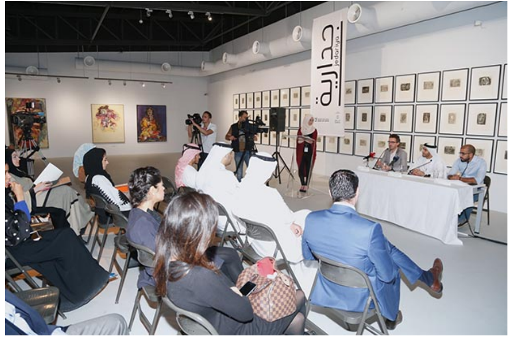
Images from the Launching Press Conference

Maraya Art Centre intends for all projects led under this initiative to have a community incentive, which sometimes can be as simple as merely getting young people involved in the arts, while at other times may require them to actively participate in aid of raising awareness for an important cause, in addition to creating beautiful landmarks in Sharjah.