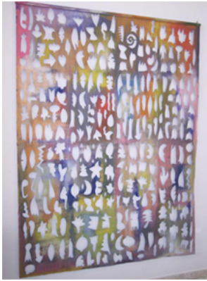
Sans titre