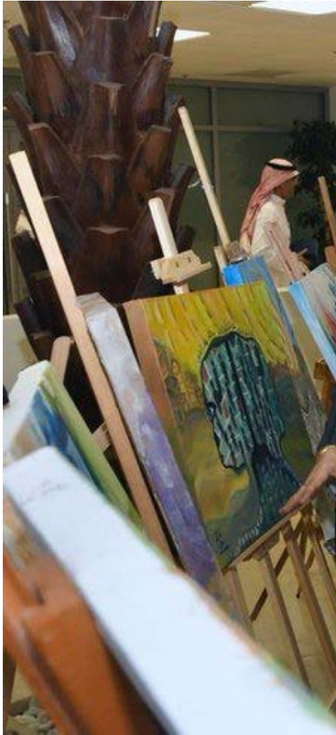
After announcing the 10 prize winners was inaugurated.