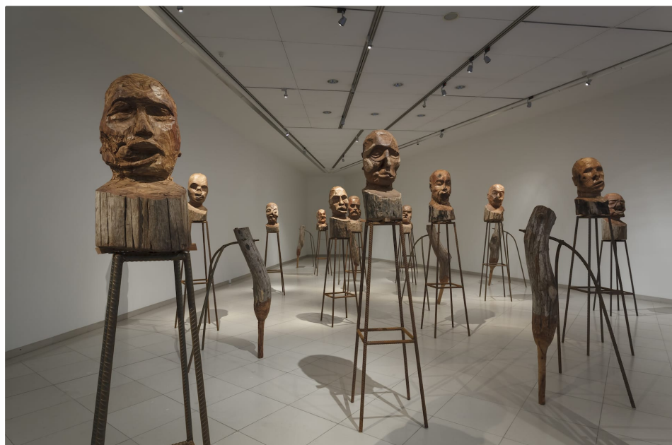
Kader Attia, J'Accuse 2016