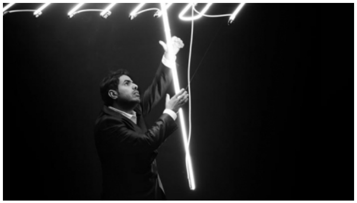
1979 born in Abha, lives in Jeddah.