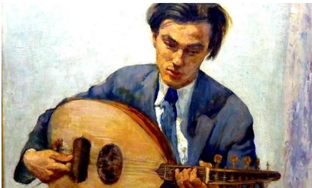
Bicar playing the lute by Ahmed Sabry (Wikimedia Commons)

Opening up your browser in the Middle East this morning, you will have been greeted not by the ordinary Google letters, but with a sophisticated-looking piece of artwork.