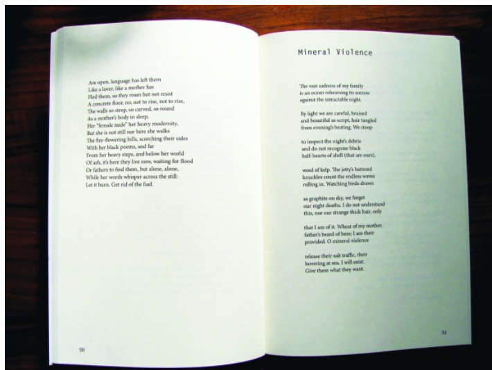
Quinn Latimer, Your Poem is the Letter I Write, 2012