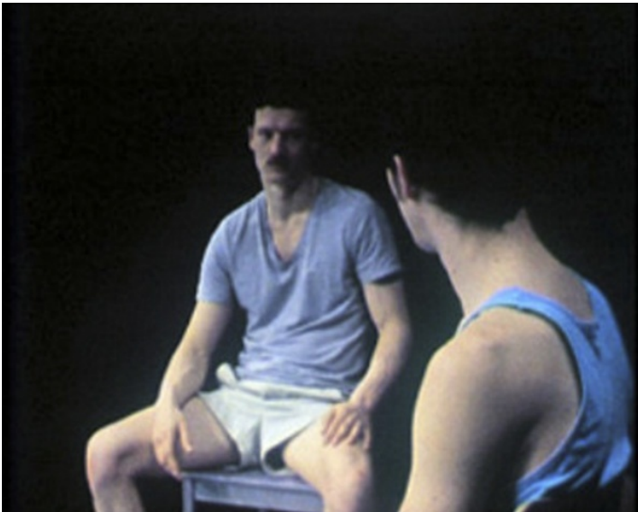
Shahryar Nashat, Modern Body Comedy , 2006