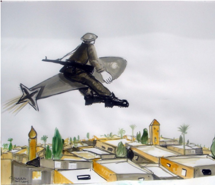
Mohammed Al-Hawajri, M43 , 2009