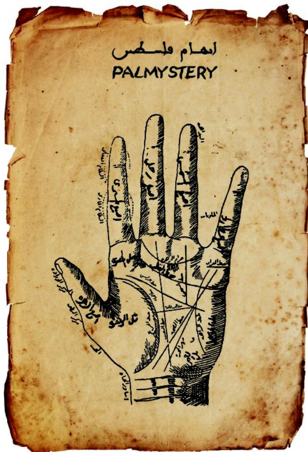
Wafa Hourani, Map legend for palm reading, research material for Palmystry, 2012