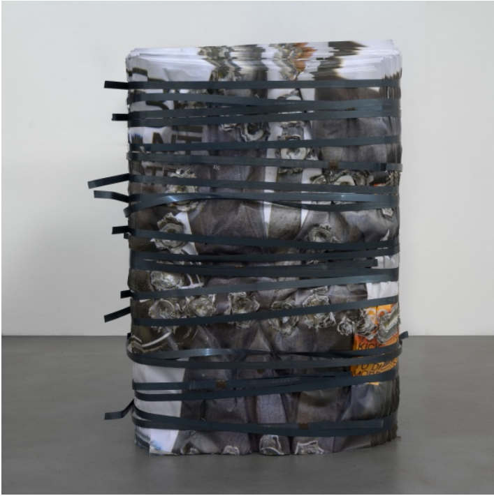
Matias Faldbakken, Poster Sculpture , 2010