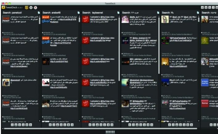
Ra'ouf Haj Yehia, Untitled , 2012