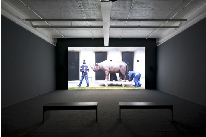
Javier Téllez, O Rinoceronte de Dürer (Dürer's Rhinoceros) , 2010