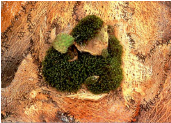
Untitled, 1999, cactus basket & moss