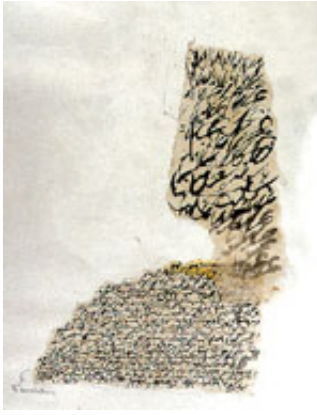
"My Mona Lisa," 1996, ink and henna on paper