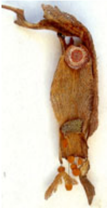
Untitled, 1994, cactus and ceramic

She also uses cactus as a medium for conceptual three-dimensional work. The most recent was exhibited in Al-Quds (Jerusalem) at Al-Wasiti Art Center. The work was a green cactus leaf the lower half of which was dipped in chocolate. Rana titled it "Sweetie." It is a description in symbolic form of our experience. Think of all that is beautiful in Palestine and you cannot enjoy it because of the continuing occupation and severe oppression applied by Israel. In discussion she said that It combines something harmful and something sweet as she cited an old Arabic saying: "Ya binet into bitrushe al mote succar." (You sprinkle sugar on death).