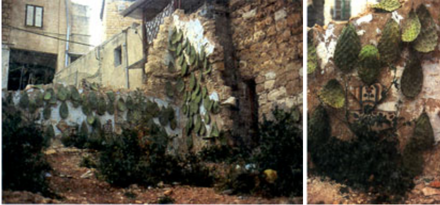
"Scream of the Valley -- Wadi Al-Nisnas," 1997, installation

of Arabic tiles often found at the site of destroyed homes. She called the work "Scream of the Valley - Wadi Al-Nisnas." She explained that Nisnas is the animal like a cat that is long in shape. And wadi means valley. The Nisnas is extinct in this valley now. Thus use of the phrase in this context is intended to describe how Arabs feel in Israel - deeply threatened. As time went by the cactus leaves sprouted and the meaning of that is not lost on either of us.