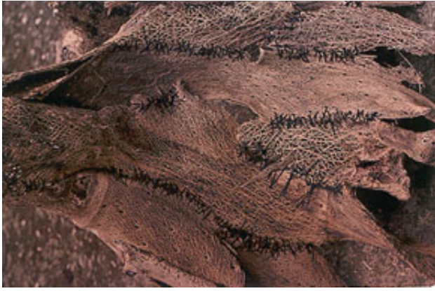
Untitled, 1999, work in progress

For example, in the garden of her studio she is building an olive tree from dry cactus leaves. It is an ambitious project. Looking at it and trying to explain where it is going she said: "I am born after the 'Nakbeh' but I get it all from my father and mother and my experiences from the 'Day of the Land' and my own continuing experience. I am breathing politics and oppression here and it confirms what my parents tell me. We experience exile right in our own land. During their 50th anniversary, Israelis invited Arab artists to participate in an exhibition at their museum. They begged me to join but I refused. I am not part of it I am the other side of the 'Nakbe.' I am trying to build an olive tree from dry cactus. After I build it as an olive tree I want to hang green cactus leaves on it like a new kind of fruit. I like not always to be political in my work and sometimes to be non-political and free. They (the Israelis) think that 'saber' (cactus) symbolizes them but I think they are stupid because they found the plant here and did not have anything to do with it in their history. Even falafel and fava they take and make them out to be as though theirs." The two pictures below are two views of this work in progress. Only the lowest part of the main trunk of the olive tree is complete.