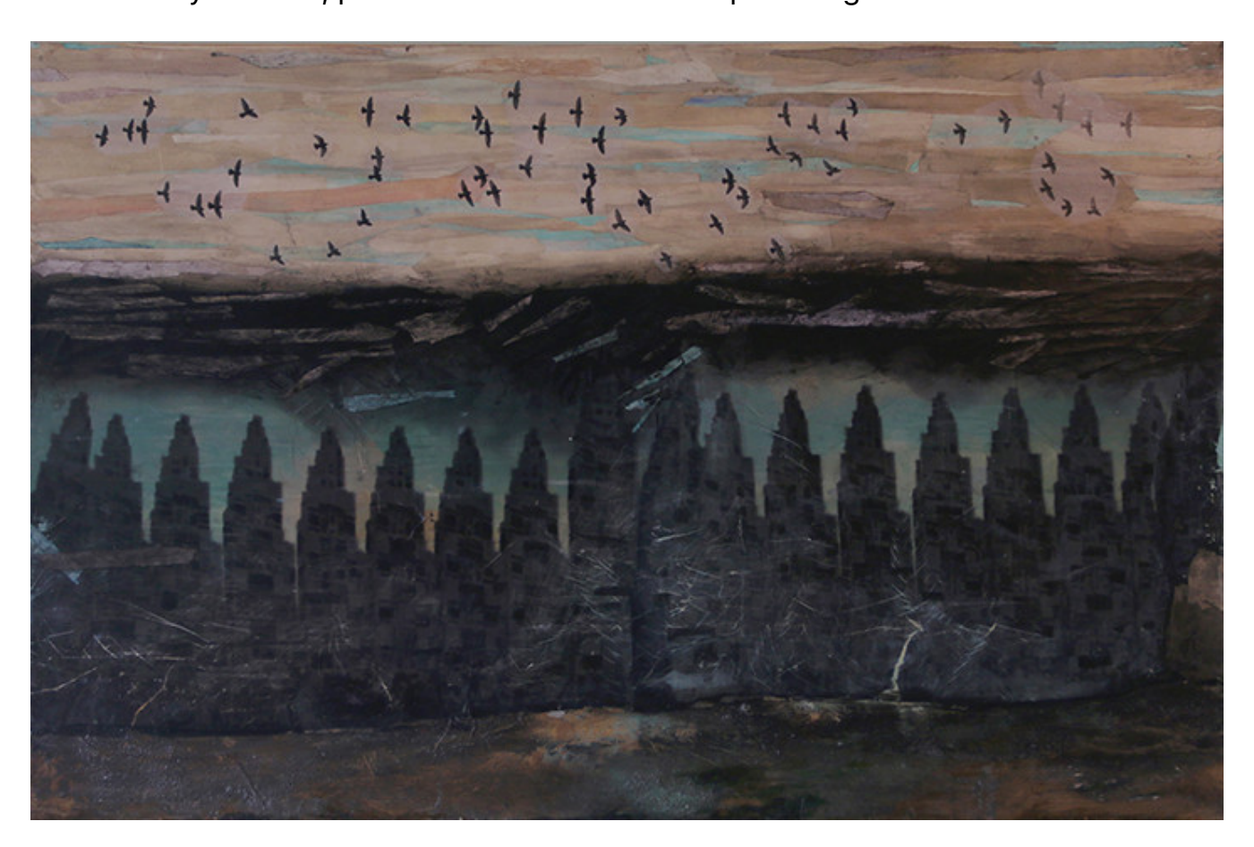
Inass Yassin, "Transformation #2," mixed media on canvas, 200x130cm, 2008

Khalil Rabah's "Art Exhibition" most cleverly encapsulates the mission of Unlike Other Springs: a single image made up of some 50 photographs of Palestinian art exhibits from as early as 1954, presented in locations that span the globe.