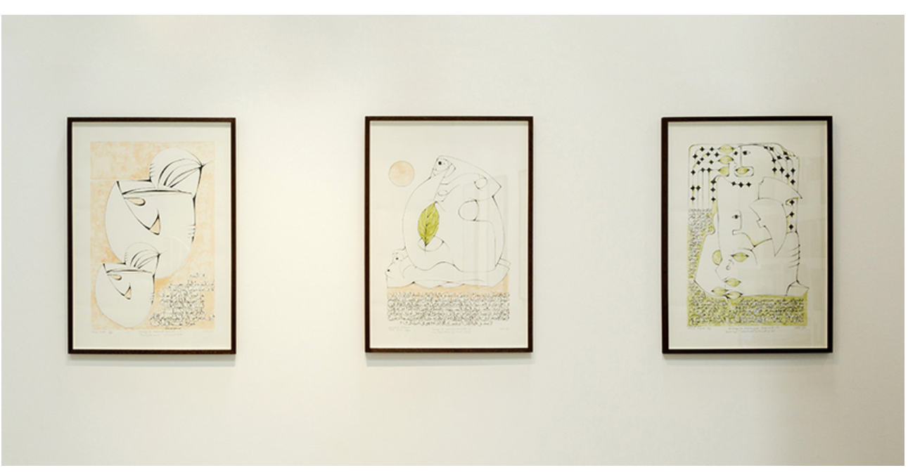
MONA SAUDI, "Homage to Mahmoud Darwish" (detail), 1976–80, installation view in "Poetry in Stone" at Lawrie Shabibi, Dubai.