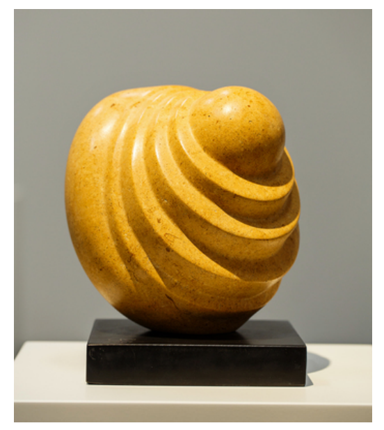
MONA SAUDI, The Seed , 2007, Lebanese marble, 25 \times 22.5 \times 22.5 cm. Courtesy the artist and Lawrie Shabibi, Dubai.

2/7/18, 1:59 PM ArtAsiaPacific: Poetry In Stone