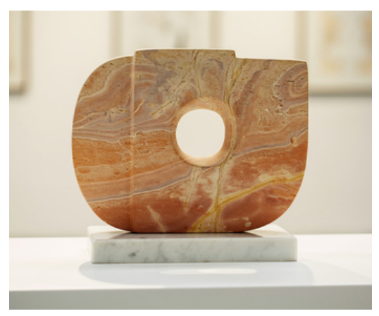
MONA SAUDI , Sunset in Pink , 2012, Amman limestone, 25 \times 22.5 \times 22.5 cm. Courtesy the artist and Lawrie Shabibi, Dubai.

The images depicted on the prints appear sculptural in form, mimicking her three-dimensional work in its use of strong, geometric and organic lines.