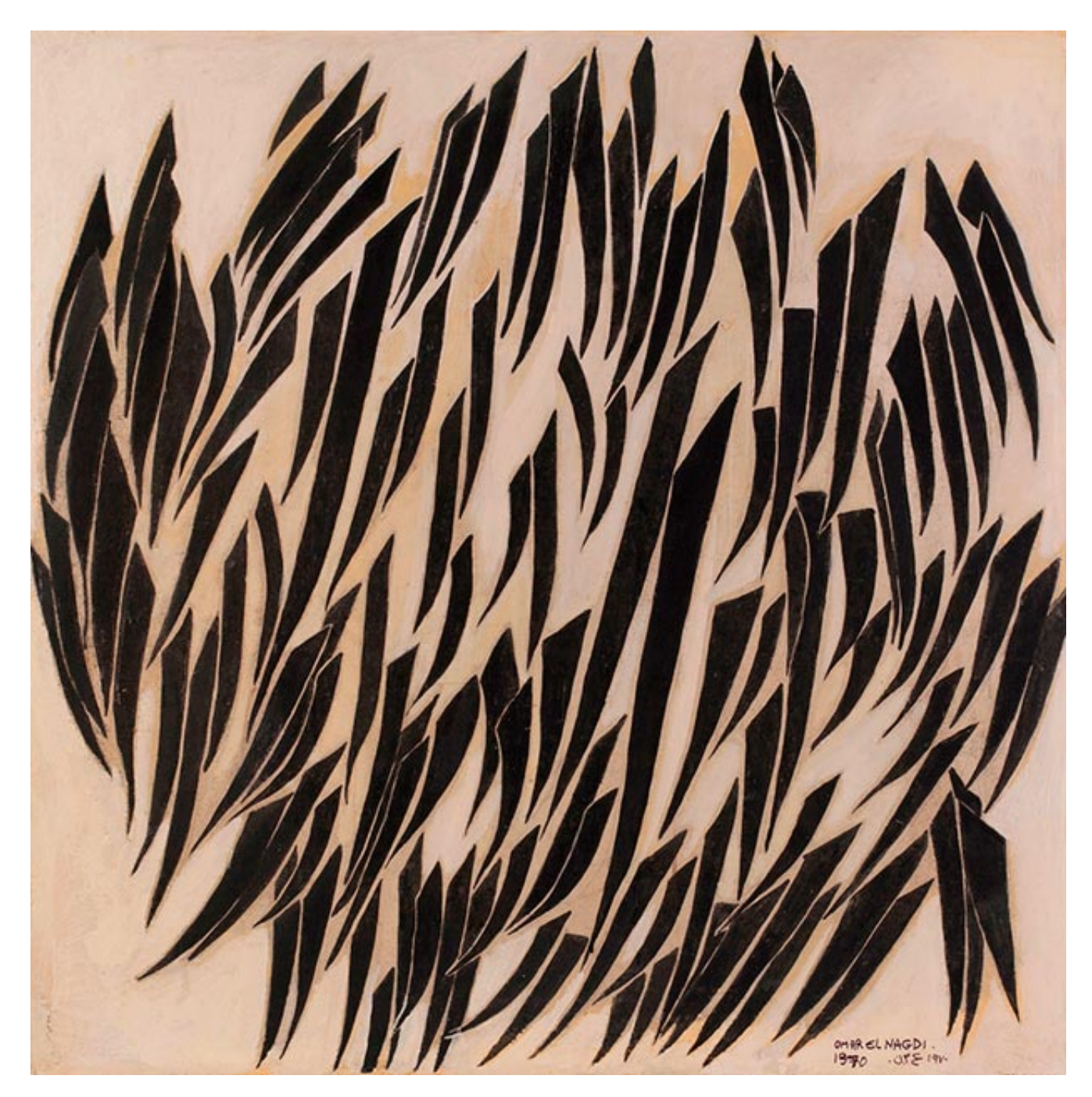
Omar El Nagdi / Untitled, 1970

referencing Islamic tradition. Each artist featured in this exhibition brings his/her own influences to pieces that are contemplative and constructive."