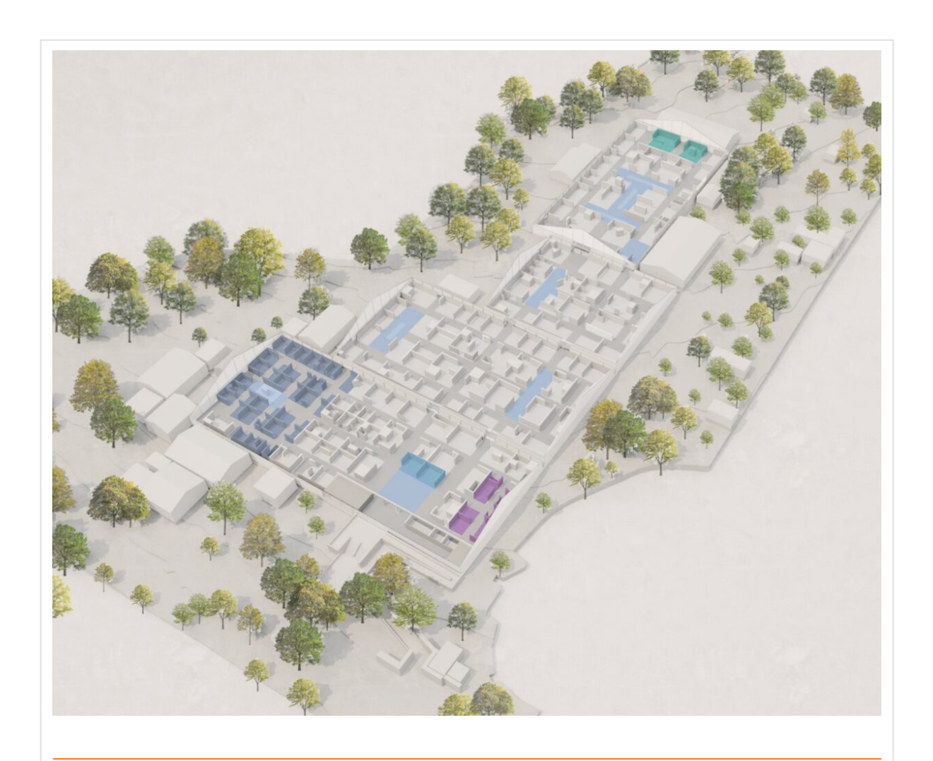
Overall Diagam © A Studio Between

Enhanced Visitor Amenities : The redesign also focuses on improving the visitor experience, including comfortable seating areas, new dining options and enhanced accessibility features. The aim is to provide a welcoming and inclusive environment for all attendees.