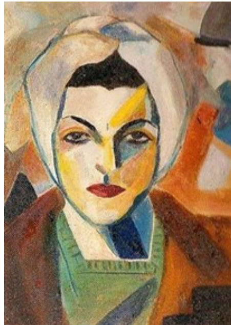
{Saloua Raouda Choucair self portrait}

← Previous ( http://cloudoflace.com/the-authentic-tabbouleh-recipe/ ) Next → ( http://cloudoflace.com/lentil-salad/ )