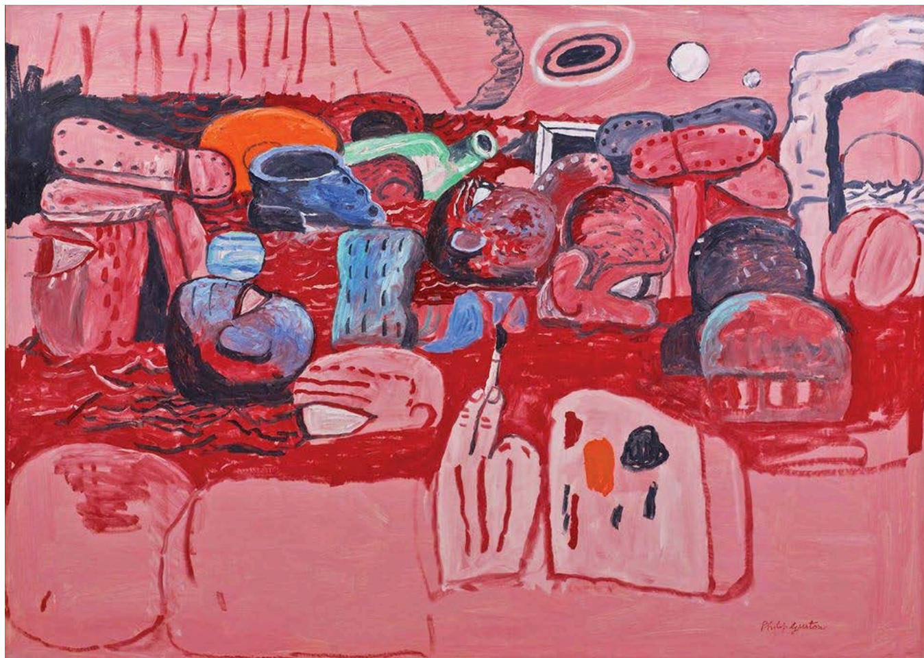
Philip Guston's Deluge II (1975) at the

Punctuating the quiet of the gallery is a 1979 video of Lotty Rosenfeld's A Mile of Crosses on the Pavement , in which the Chilean artist turned road markings into crosses in a protest against Augusto Pinochet's military dictatorship in Chile.