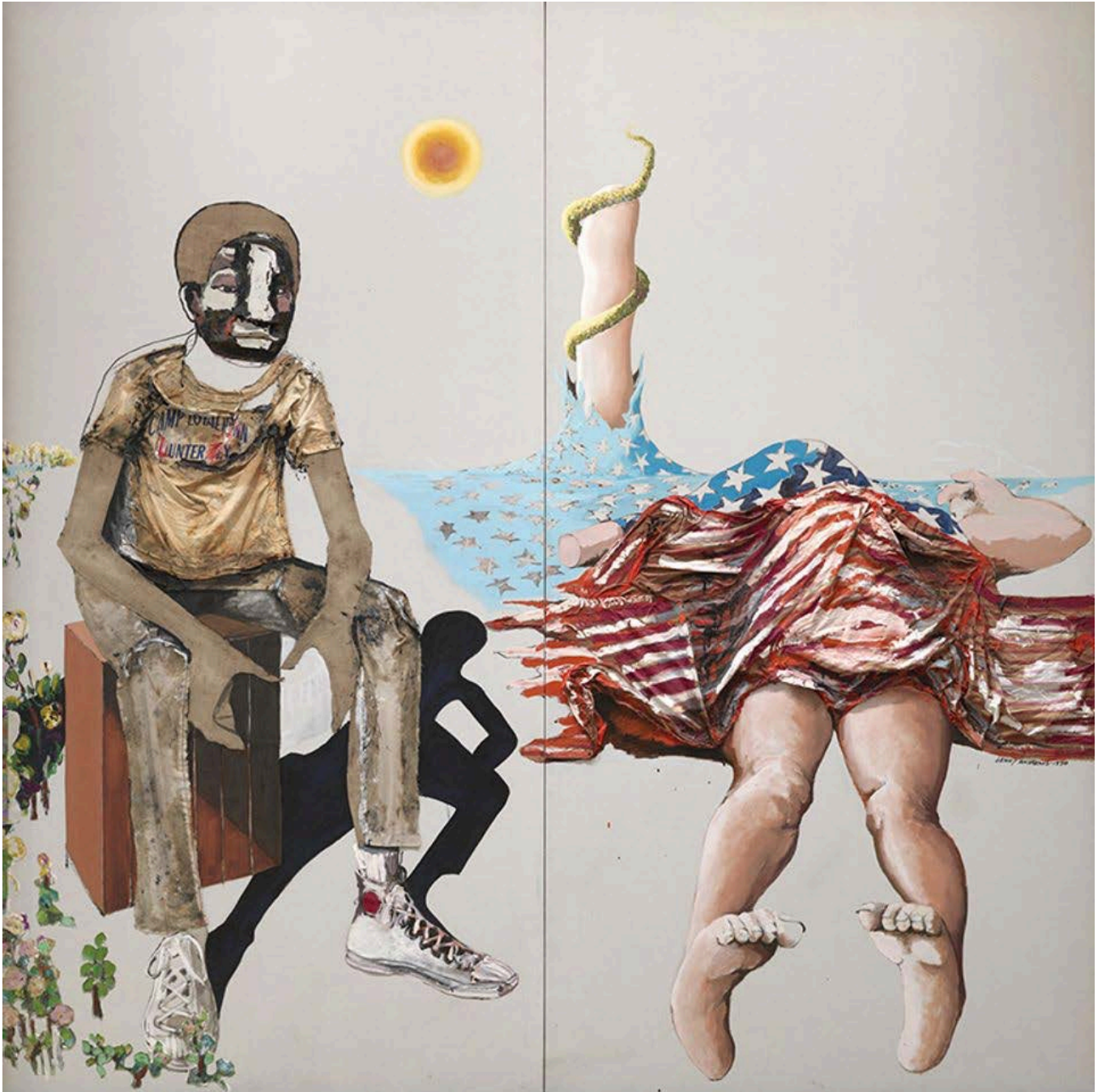
Benny Andrews's No More Games (1970) at the Museum of Modern Art Museum of Modern Art