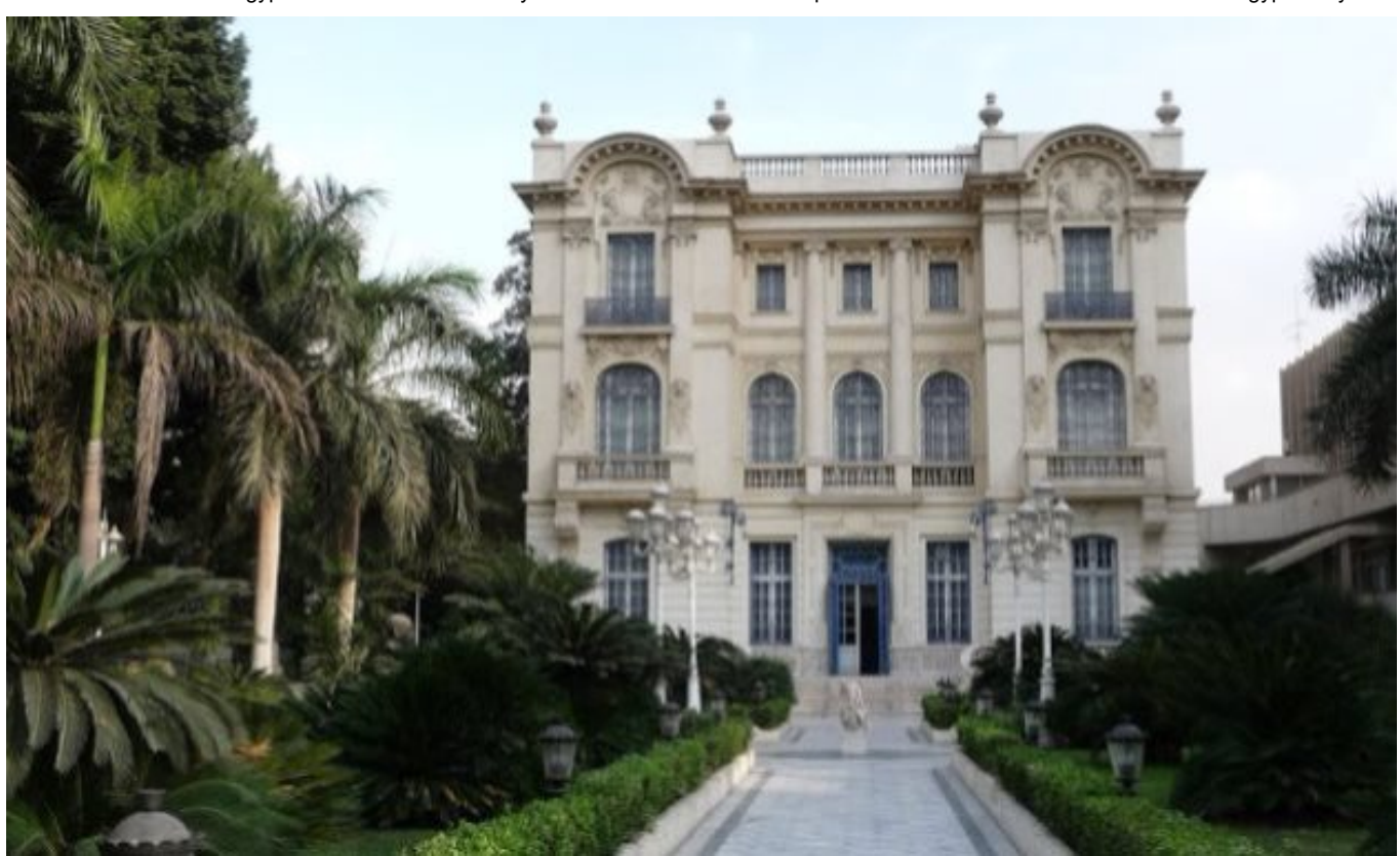
Mohamed Mahmoud Khalil Museum - ET

The museum was closed in 2010 and development work began in 2014.