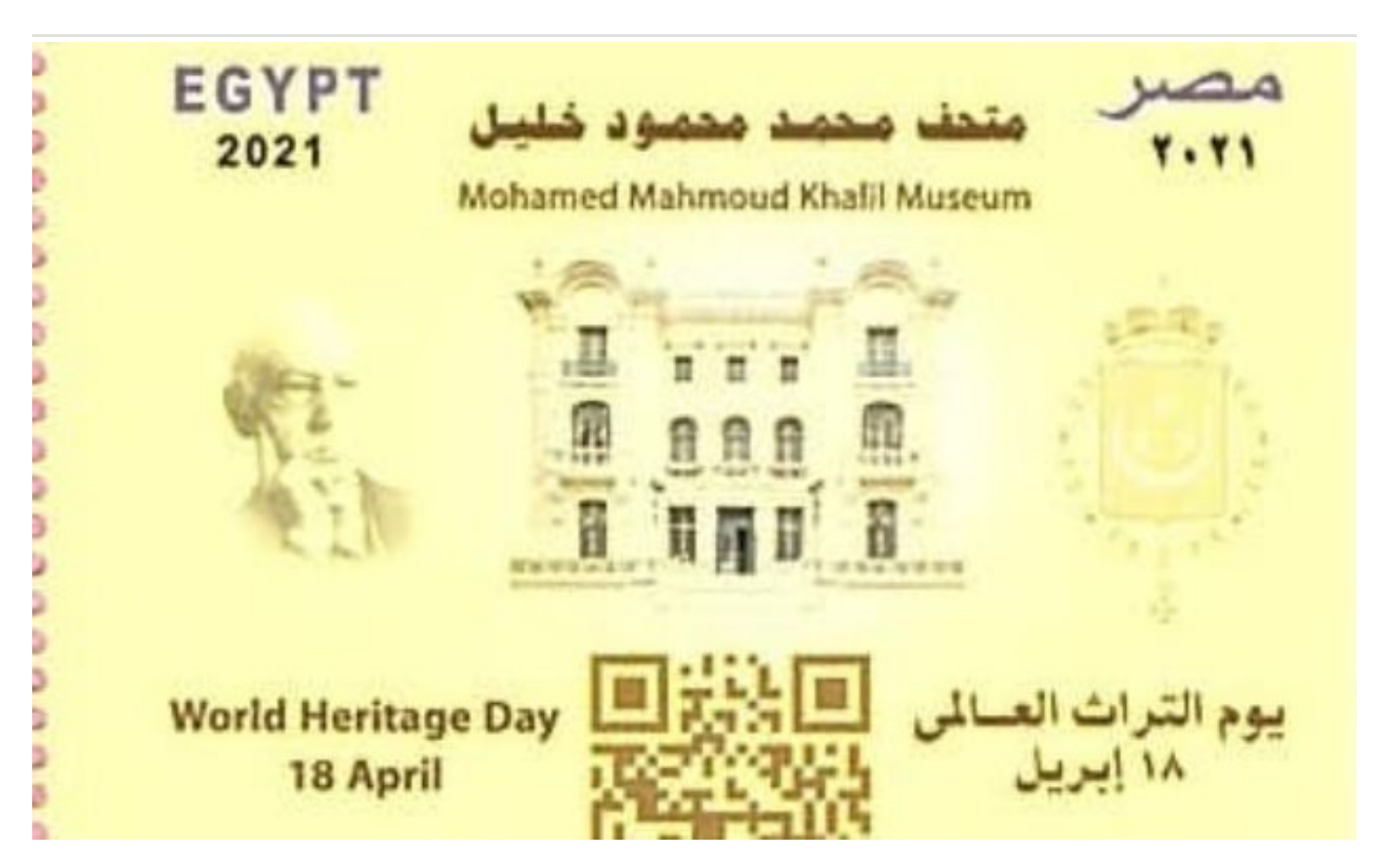
The Stamp - Min. of Culture

CAIRO - 20 May 2021: Egypt's Minister of Culture Inas Abdel Dayem thanked Minister of Communications Amr Talaat after the National Post Authority issued a commemorative