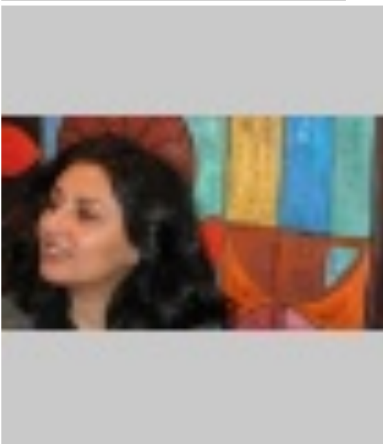
( /index.php/news/13-artists-news/101-maysaloun-faraj )