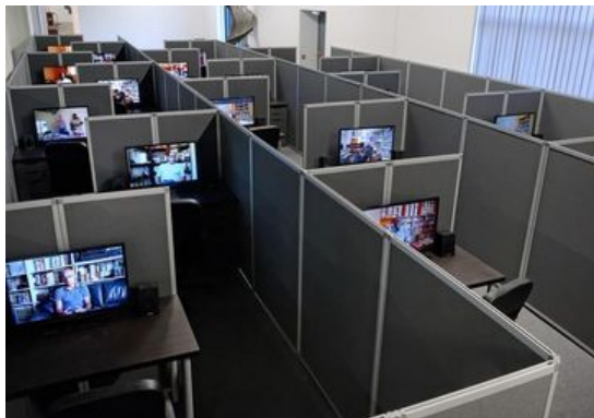
Courtesy the artist, Lehmann Maupin, New York and Hong Kong, Galerie Nagel Draxler, Berlin, and la Biennale de Lyon.