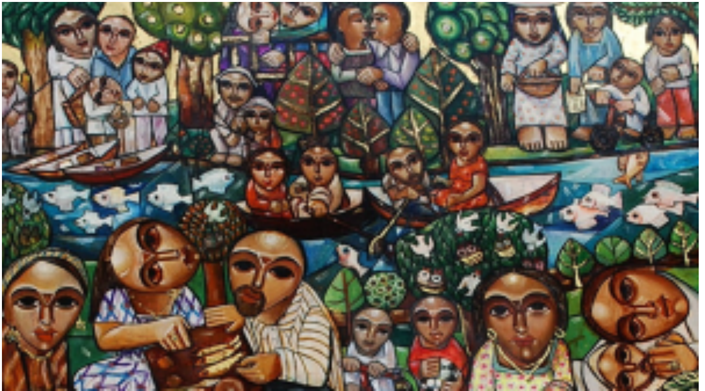
( https://copticliterature.files.wordpress.com/2014/01/17.png )