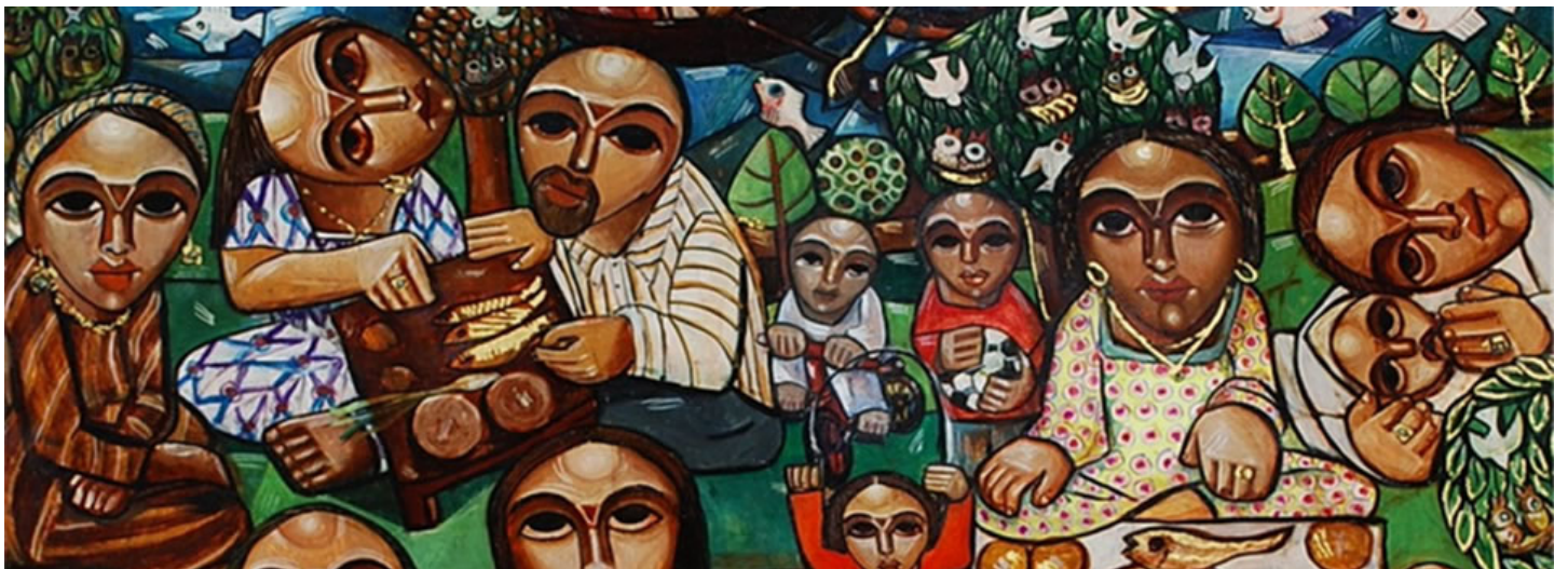
( https://copticliterature.files.wordpress.com/2014/01/14.jpg )