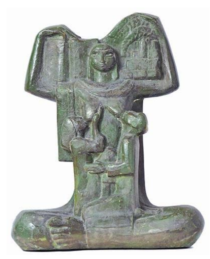
Egypt My Mother Land

Constantly concerned with his home country's issues, El-Sagini featured Egypt in most of his works expressing hope, encouragement, disappointment or just pure unconditional love. Introducing symbolism in Egyptian sculpture, El-Sagini used different symbols of Egypt during times of joy, despair, victory and defeat.