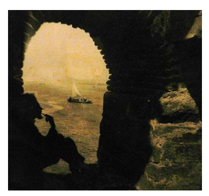
El-Sagini by the River Nile

El Sagini always saw the River Nile as the symbol of prosperity and well being picturing the Nile as an old bearded man in his Statue "The Nile" (Bronze- 100x50x8 cm-1958), yet he also considered it his source of solace and relief.