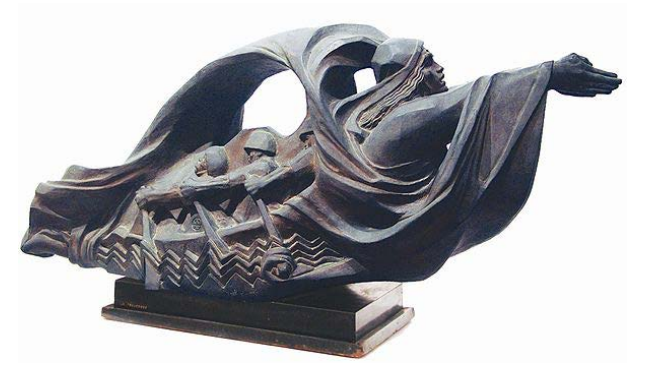
The Great Crossing of The Suez Canal