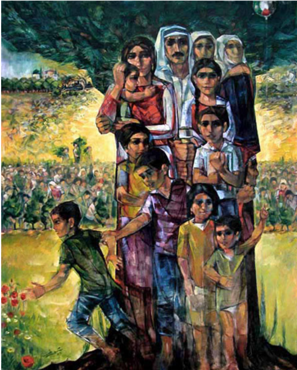
"The Olive Tree", 2005

Samia A. Halaby The Electronic Intifada 5 July 2006