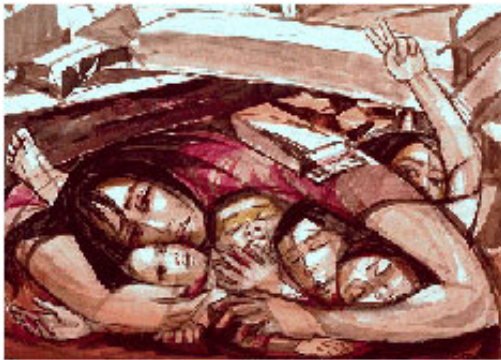
"Tel Al-Zaater 1976, in Shelter", 1976