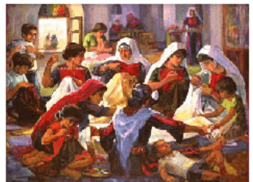
"For the Coming Joy", 1987

Shammout's studio was the place we went to as one goes to the source, a wealth of information and documents, a place of quiet, a place for thought and art, a place of gentleness, and above all a cultural storehouse of