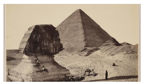
12 photos from the first documented British royal tour of the Middle East

A 'Metropolis' 28 years in the making: 1,000 handmade clay objects