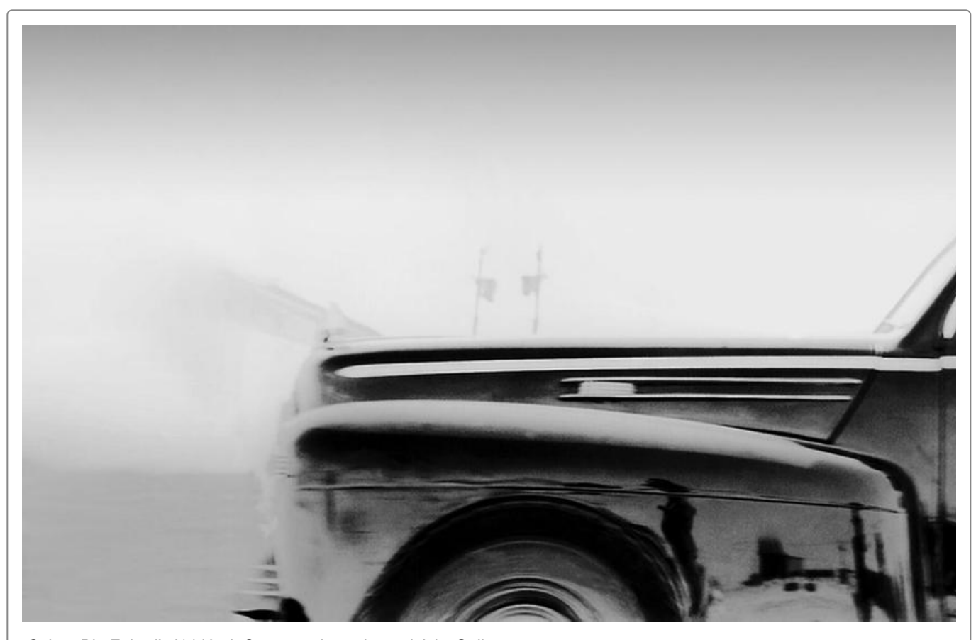
Sultan Bin Fahad's '1440m'. Courtesy the artist and Athr Gallery

Athr Gallery's micro-grant initiative will provide financial support of $1,300 to $2,600 for artists living in Saudi Arabia