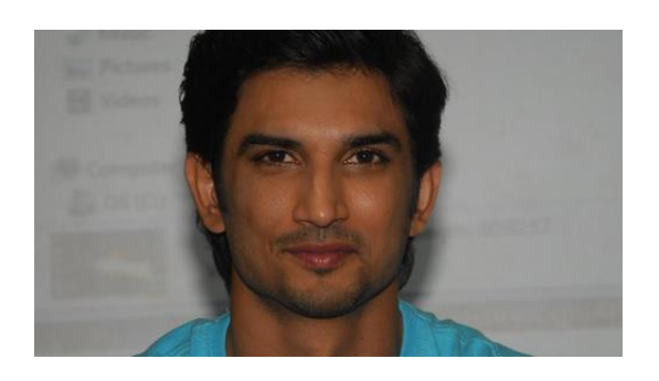
Bollywood actor Sushant Singh Rajput dies aged 34 Film