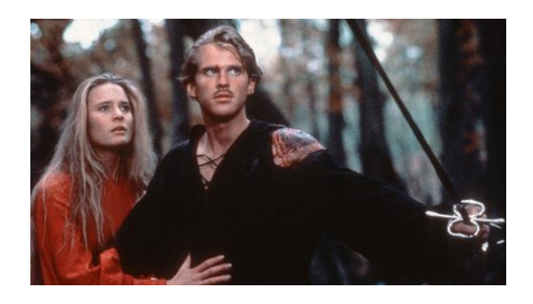
Eight '80s films that have aged surprisingly well Film