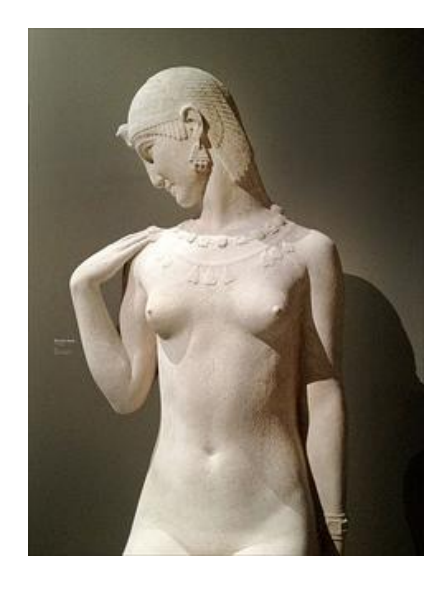
Mahmoud Mukhtar, Bride of the Nile, 1929 © Jean-Pierre Dalbéra, licensed under Wikipedia Creative Commons

After returning from Paris Mukhtar became involved in the Wafd party, a nationalist liberal political party which was dominant in the first independent government. He subscribed to the 'Nahda' ideal of an Egyptian cultural and national renaissance, as the title of this sculpture makes clear. The