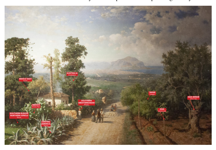
Francesco Lojacono's View of Palermo (1875).

Palermo's botanical garden and a painting by Francesco Lojacono, View of Palermo (1875), serves as a starting point for the team's curatorial concept. The landscape, which pictures olive trees from Asia, aspen from the Middle East and eucalyptus from Australia alongside other foreign natural bounty exemplifies the migratory forces that have always been at work in the city. Inspired by this and Palermo's botanical garden Orto Botanico, which was founded in 1789 as a laboratory to test, mix and gather diverse species, Manifesta 12 will look at the notion of the world as a "garden", and as a creative site for aggregating differences, capturing motion and migration, and the cross-pollination of goods, people, and ideas (you can read the full concept <a href="http://m12.manifesta.org/planetary-garden/">http://m12.manifesta.org/planetary-garden/</a>)).