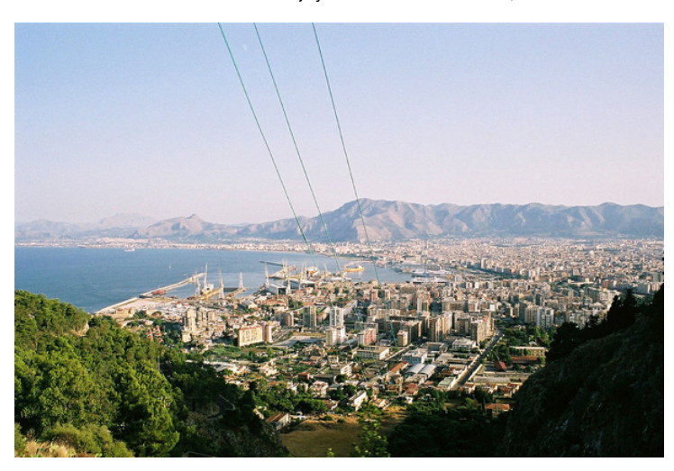
Palermo Panorama