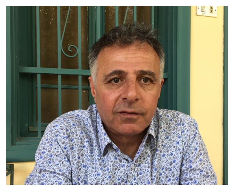
Khalil Rabah.

• One of the most exciting projects comes from Khalil Rabah, artist and director of the Riwag Biennale (http://riwagbiennale.org/en/), who will create a market of artifacts at the Botanical garden decorated with assemblages and sculptures inspired by local markets on the island.