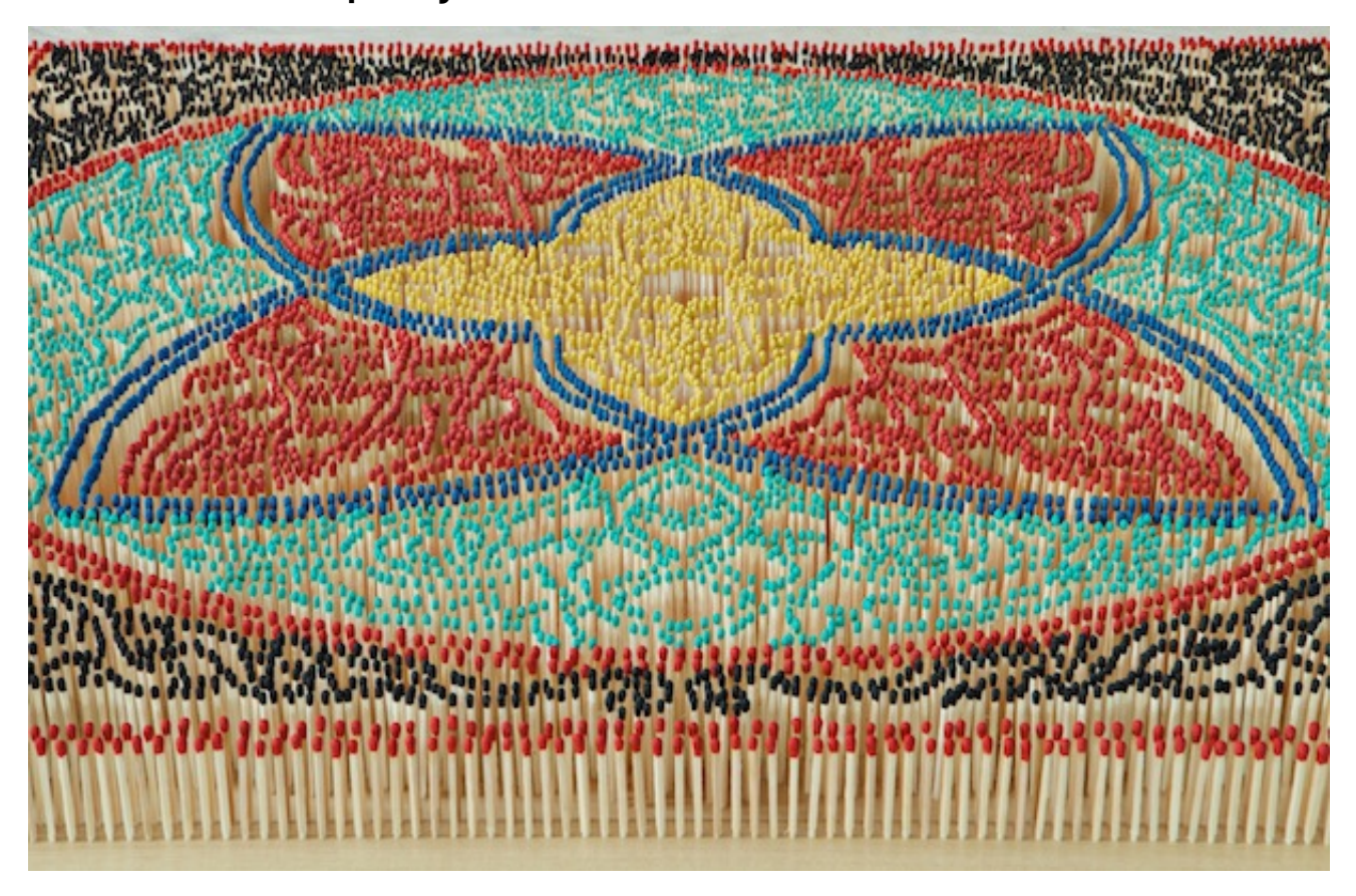
[Khayameya, 2012. GALLERIA CONTINUA, San Gimignano / Beijing / Le Moulin.]

Contemporary art could be and should be an international language and a common experience to make different sensibilities and cultures meet and mix. This is the idea and the spirit inspiring the exhibition A bridge between Pisa and Santa Croce sull'Arno dedicated to Moataz Nasr, one of the most renowned Arab artists on the international contemporary art scene.