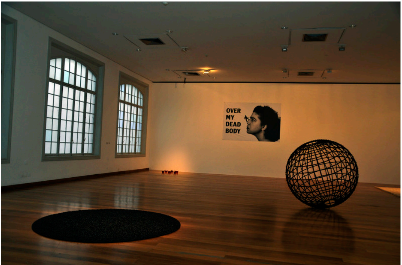
Mona Hatoum artworks at the Pinacoteca in Sao Paulo.

After a run in Sao Paulo, it will transfer to Argentina's Fundacion Proa ( http://www.proa.org/esp/ ).