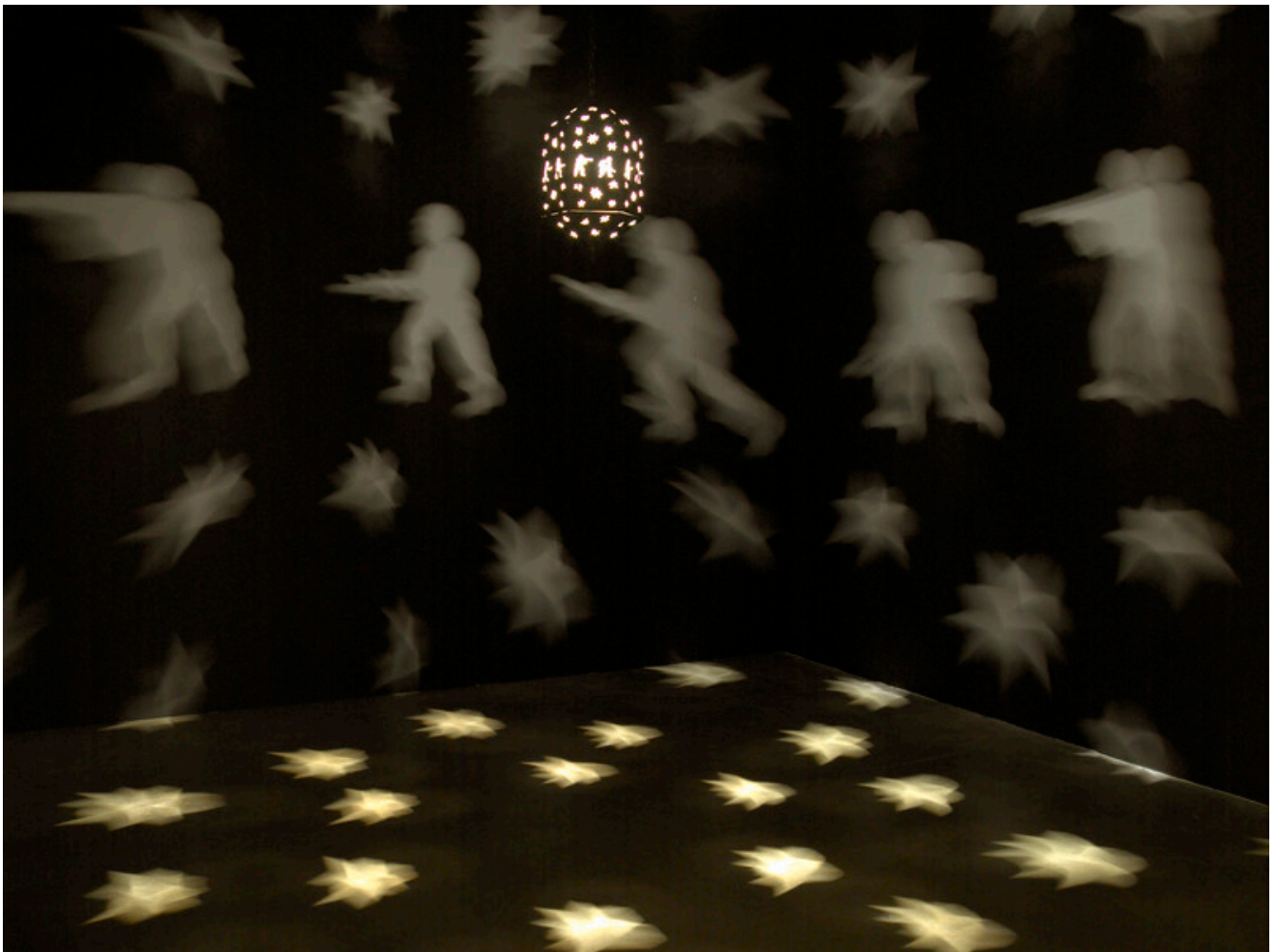
“Misbah,” Mona Hatoum, 2006–2007

The work of Palestinian conceptual artist Mona Hatoum is being celebrated with a major one-woman show at the Pinacoteca