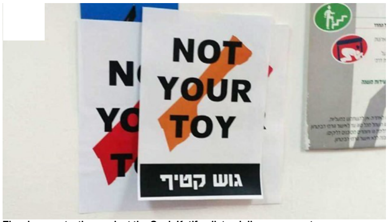
The signs protesting against the Gush Katif unilateral disengagement

"People are silent (about this) because they're afraid to speak up," she lamented. "I cannot remove them myself because they will say that I am infringing on their freedom of expression. It will also not help because it will only spur them even further."