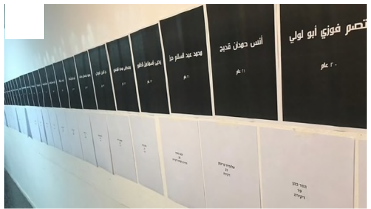
Signs of Israeli victims of Hamas

Hours later, students at the school hung white signs underneath the black ones with the names, age and cause of death of Israeli citizens slain in terror attacks perpetrated by Hamas.