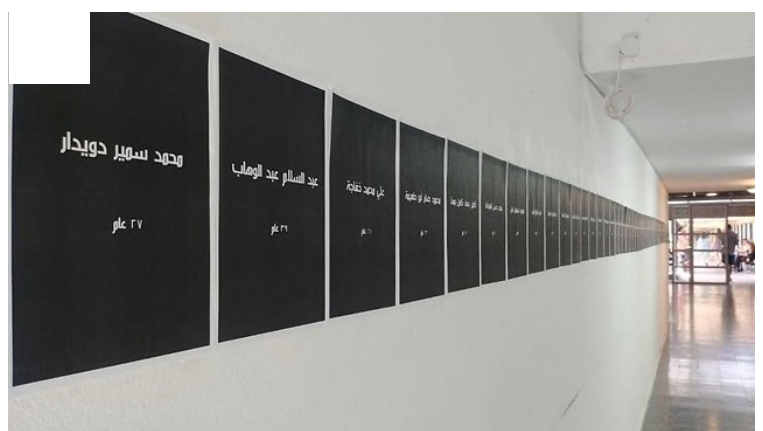
Signs memorializing those killed on the border

Sixty-one people were killed in Monday's riots, with more than 1,200 wounded. Senior Hamas official Salah Bardawil told Palestinian media Wednesday that 50 of the Palestinians killed in the Gaza Strip border riots Monday belonged to the terror group's ranks.