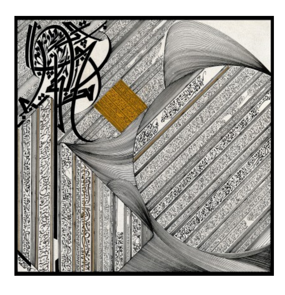
Ghubar Square II, 2009.

His work inspired by Arabic calligraphy is remarkably innovative as the aesthetic dimension of letters brings forth a sense of the poetic – highly rhythmic – arresting us with its rich abstracts compositions. Famous for his meticulous work in ink on parchment, Mahdaoui stresses the visual impact of his compositions, devoided of actual textual meaning, which he refers to as 'calligrams' or 'graphemes'.