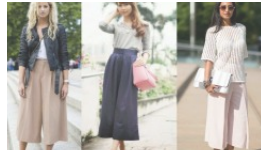
Culottes Fashion Trend September 25, 2015 In "Women Fashion"