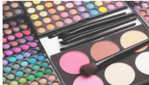
7 of the Best Makeup Artists in Lebanon March 1, 2016 In "Designers"