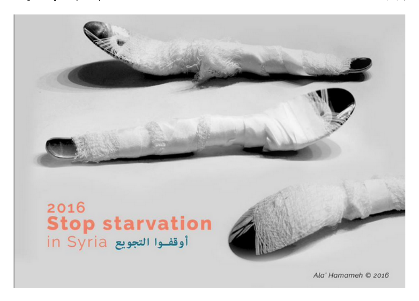
Stop Starvation in Syria by Alaa Hamameh