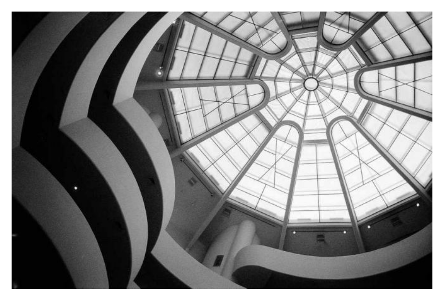
Guggenheim Museum | © Thomas Claveirole/Flickr