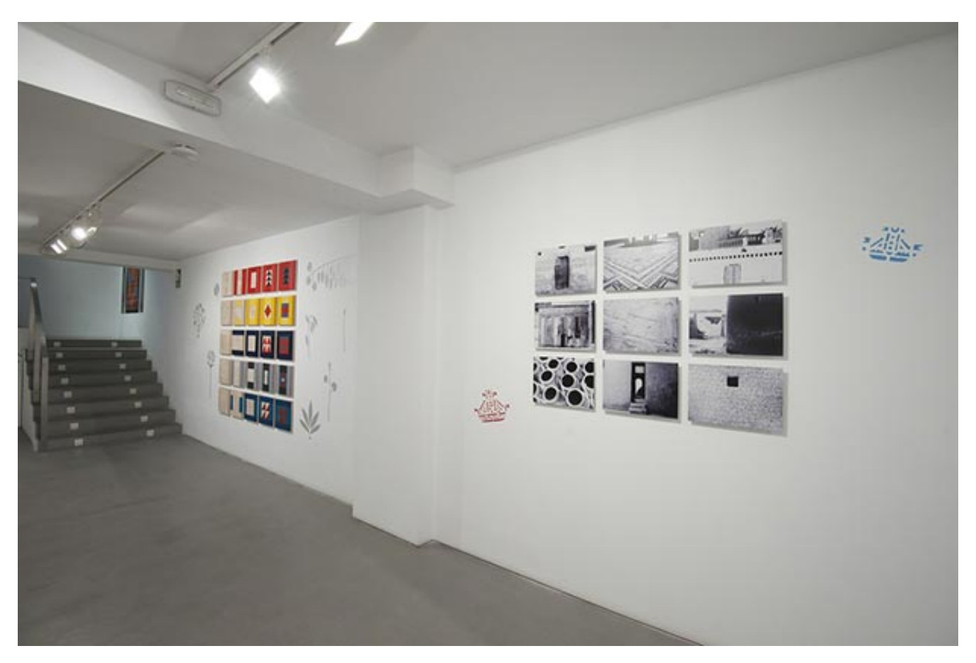
Chant Avedissian, 'Transfer, Transport, Transit', installation view