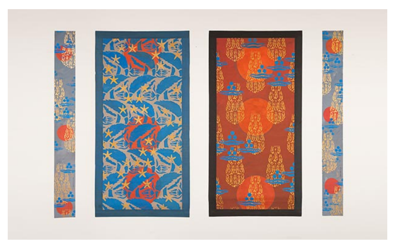
L-R. Chant Avedissian / 3 red circles on blue background, 4 Bukhara floral patterns (B5), 2016, Hand painted gouache on corrugated paper, 180x18 cm / Bukhara floral pattern, Ottoman tiger-stripe and cintamani, 3 circles (P1), 2016, Hand painted gouache on corrugated paper, 180x90 cm / Ottoman textile leaves, ancient Egyptian stars, 3 circles (P2), 2016, Hand painted gouache on corrugated paper, 180x90 cm / 3 red circles on blue background, 5 Bukhara floral patterns (B6), 2016, Hand painted gouache on corrugated paper,180x18 cm / Courtesy of the artist and Sabrina Amrani