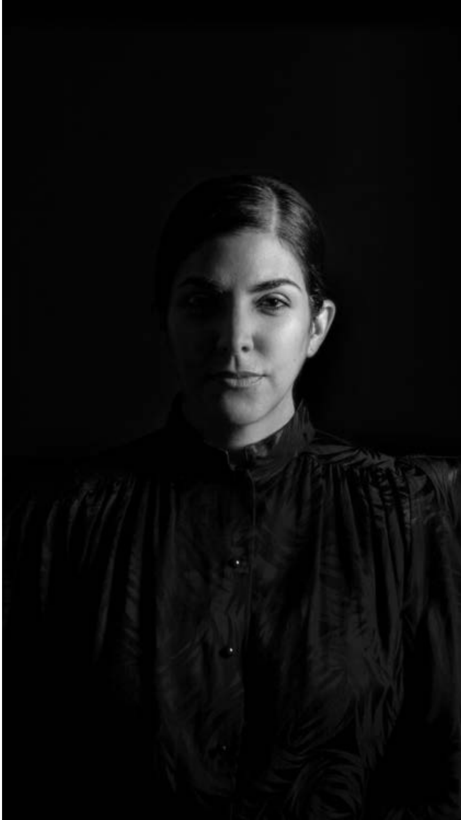
Heba Y. Amin, 'Portrait of Woman as Dictator I', 2018, Archival B/W print, 80 × 63 cm.

The image, on show at Zilberman Gallery's booth, is part of Egyptian visionary Heba Amin's project 'Operation Sunken Sea'. The project is