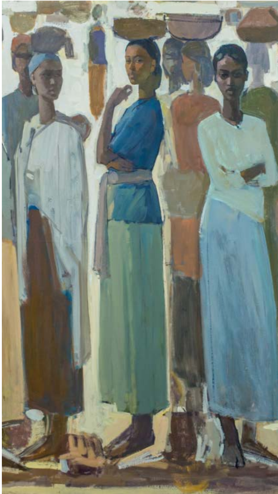
Tadesse Mesfin, 'Pillars of Life: Strength II', 2019, Oil on canvas, 147 x 112 cm.

The Ethiopian master's work, on display at Addis Fine Art's booth, is almost an ode to the women of the marketplace in his home country. The