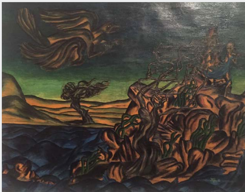
Injy Eflatoun, Girl and Beast , 1941