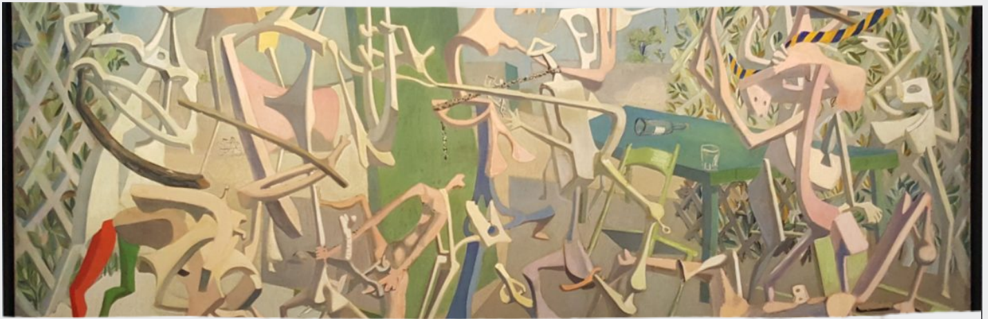
Mayo, Coups de bâtons, 1937

Two independent exhibitions commemorate an important chapter of Egyptian Modernism.