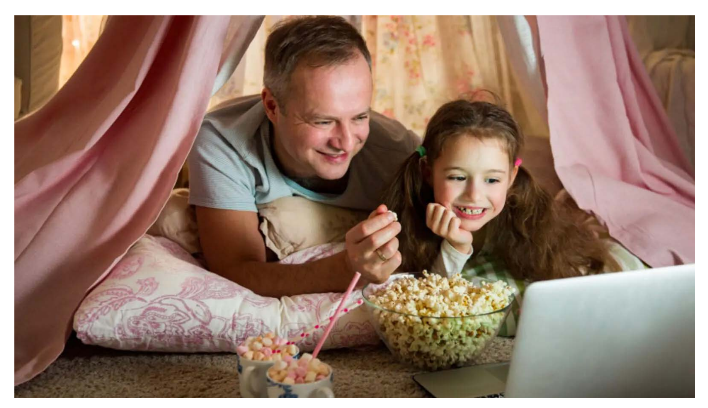
Make time for laughter