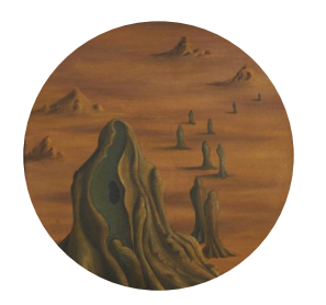
METAPHYSIC Salah Taher EGYPT