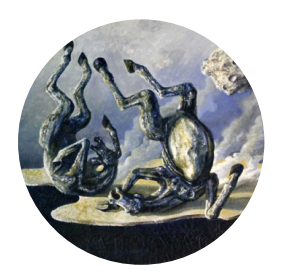
HORSE PAINTING Moosa Al Halyan UAE