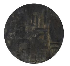
MINDSCAPE Maliheh Afnan