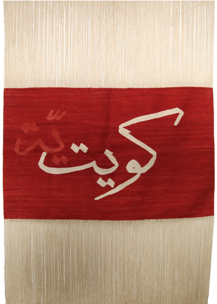
The Hub Gallery: Women in War